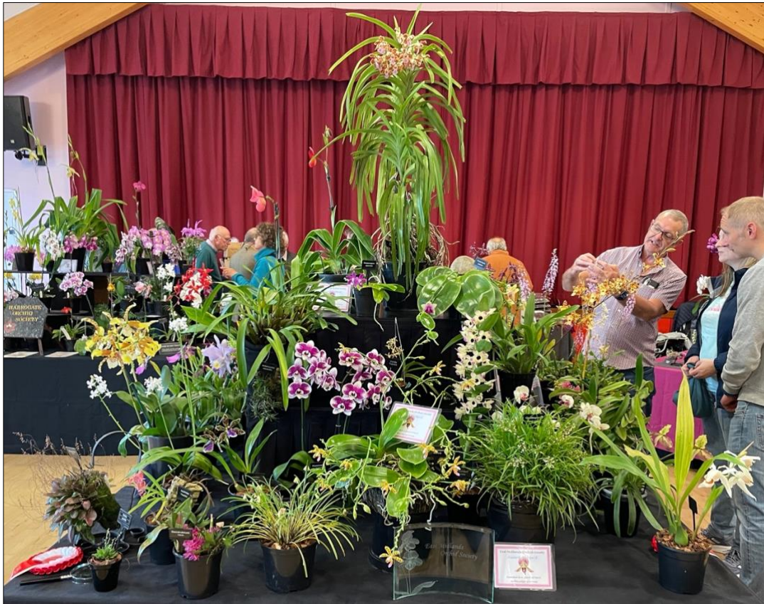
Our hosts: East Midlands