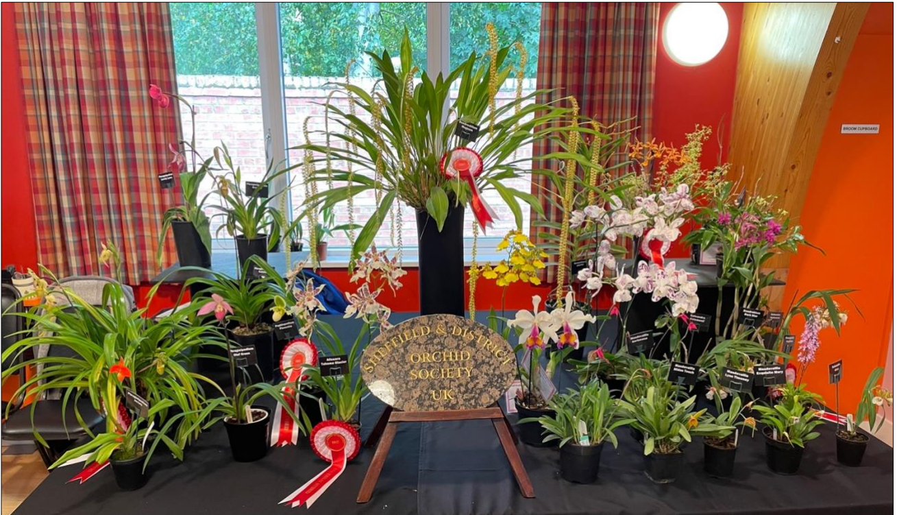
Sheffield & District