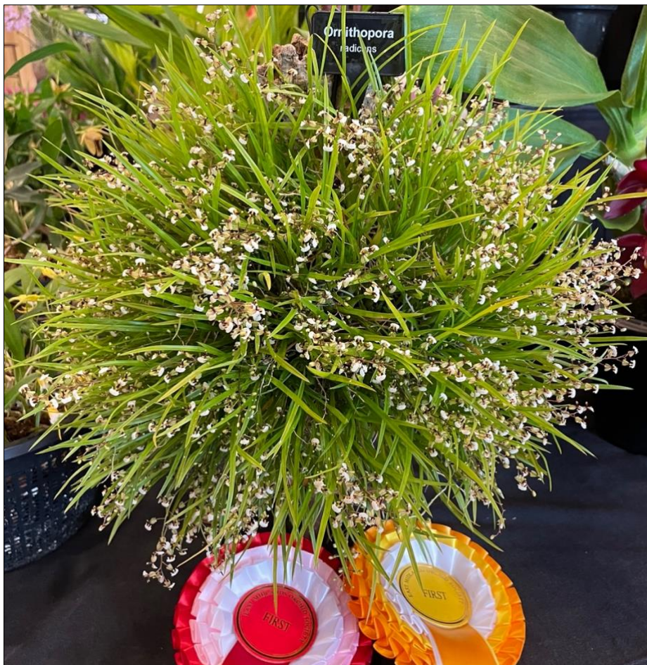
Best Species in Show: Ornithophora radicans (East Midlands)