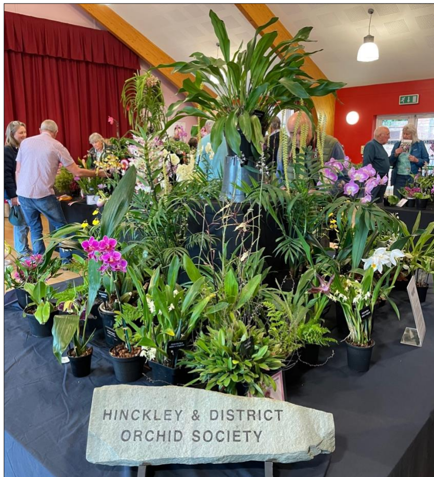
Hinckley & District