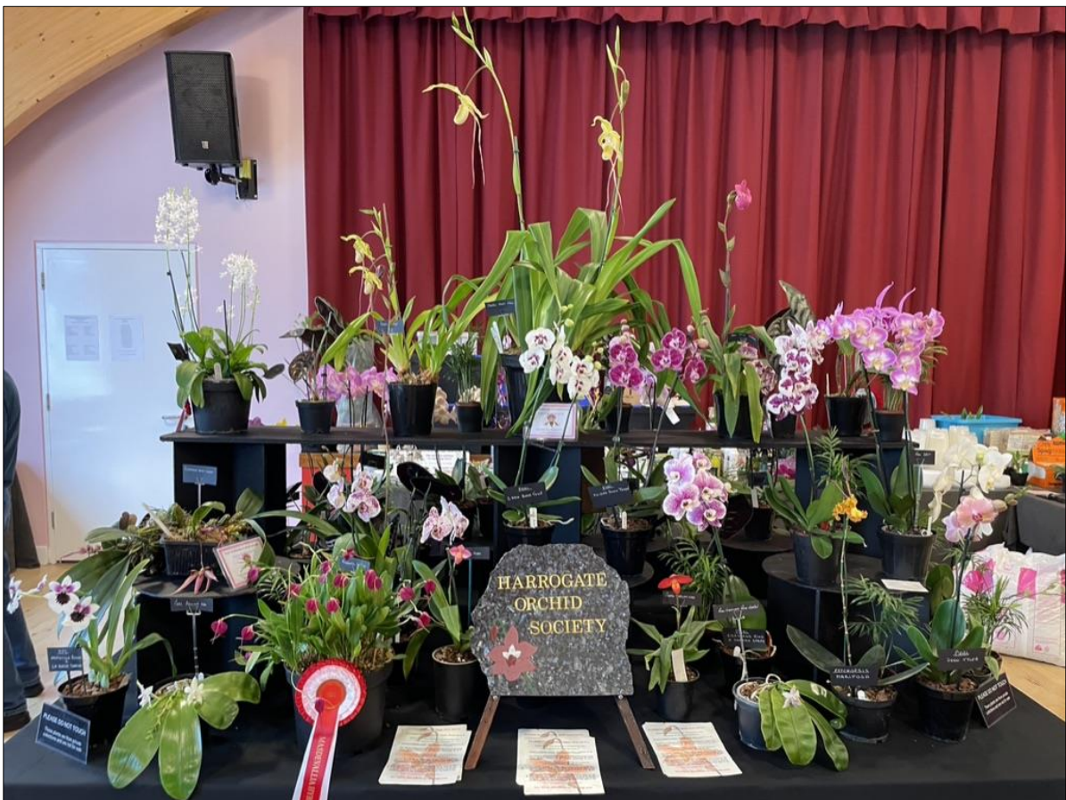
Best Society Display: Harrogate