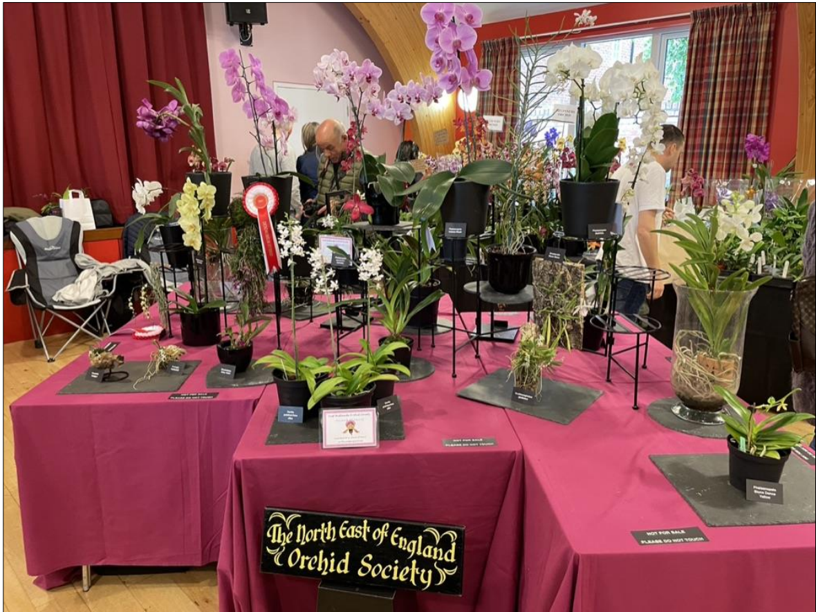
North East of England