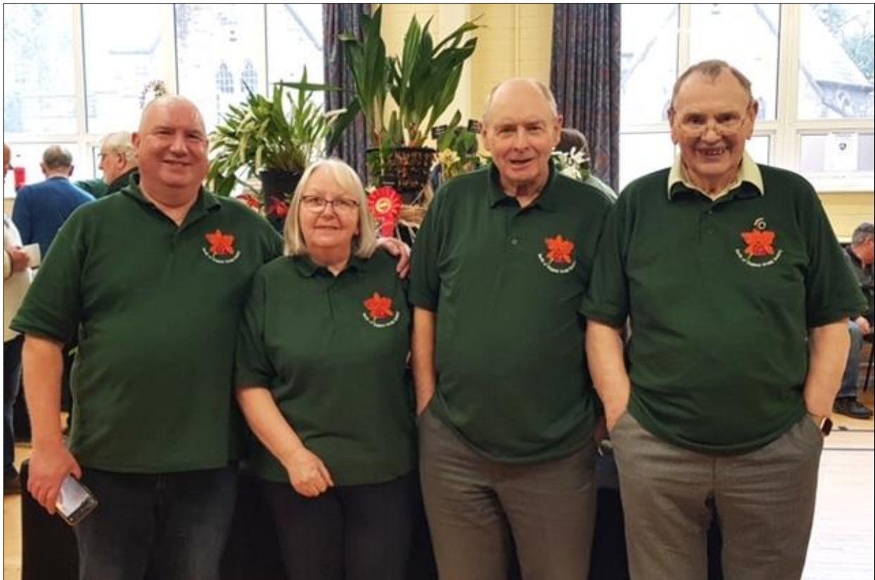
A reminder of the Sheffield show last March: Some members of the show team

And they've done all this in addition to attending our Society's monthly shows.