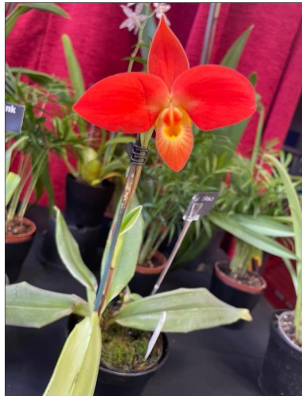
Two differently shaped clones of Phrag. Jersey