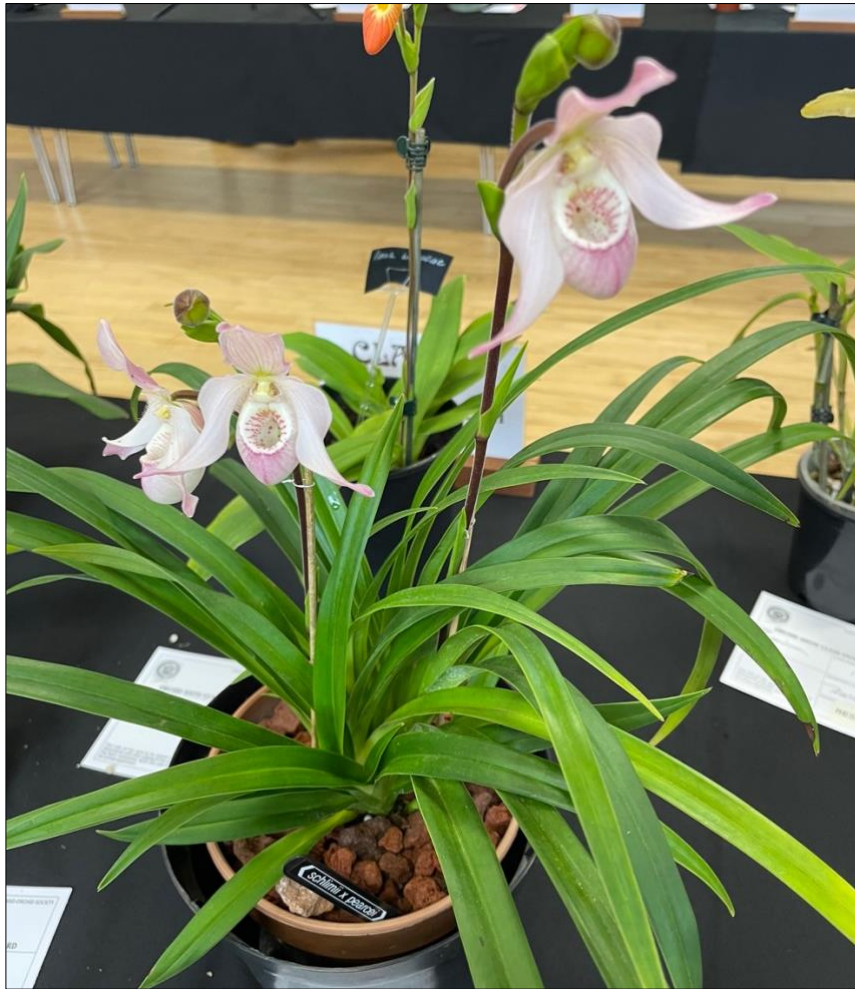
Class 9. Phragmipedium Carol Kanzer