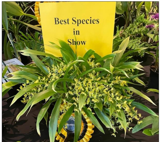
Best Species in Show: Gomesa crispa (Hinckley)