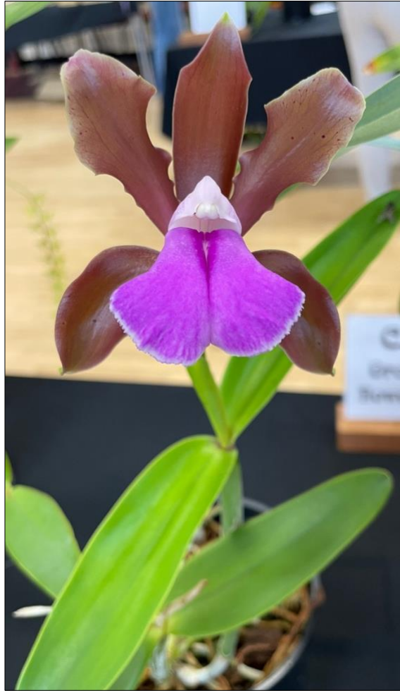
David's Cattleya bicolor