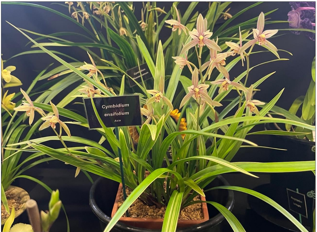
Highly Commended: Both of Barry's plants of Cymbidium ensifolium . The plant above had 7 spikes.