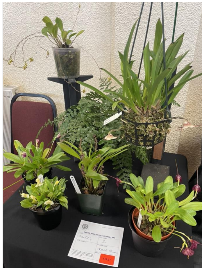
Class 3. Group of 6 orchids