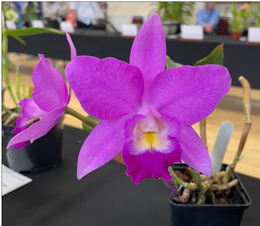
Class 10. Cattleya Love Knot 'Sato'