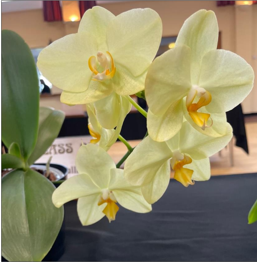
Class 23. Phalaenopsis hybrid