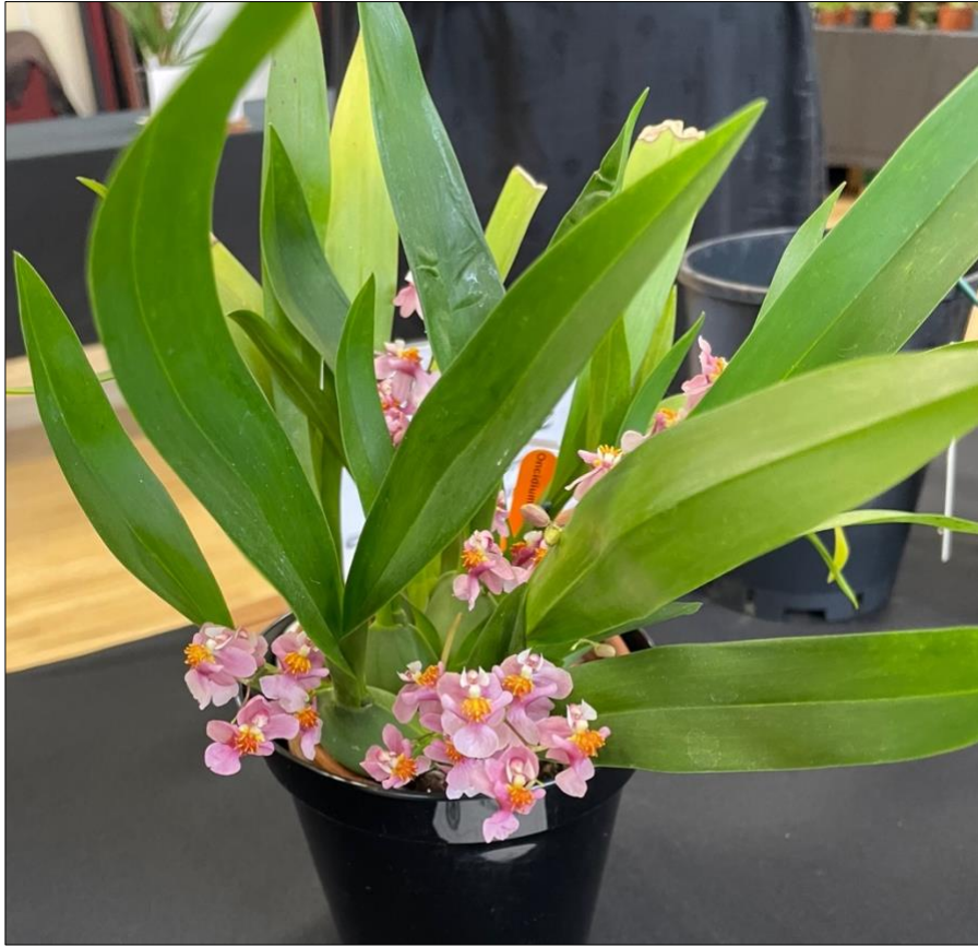
Class 11. Oncidium Tsiku Chian - Tzy Yearning