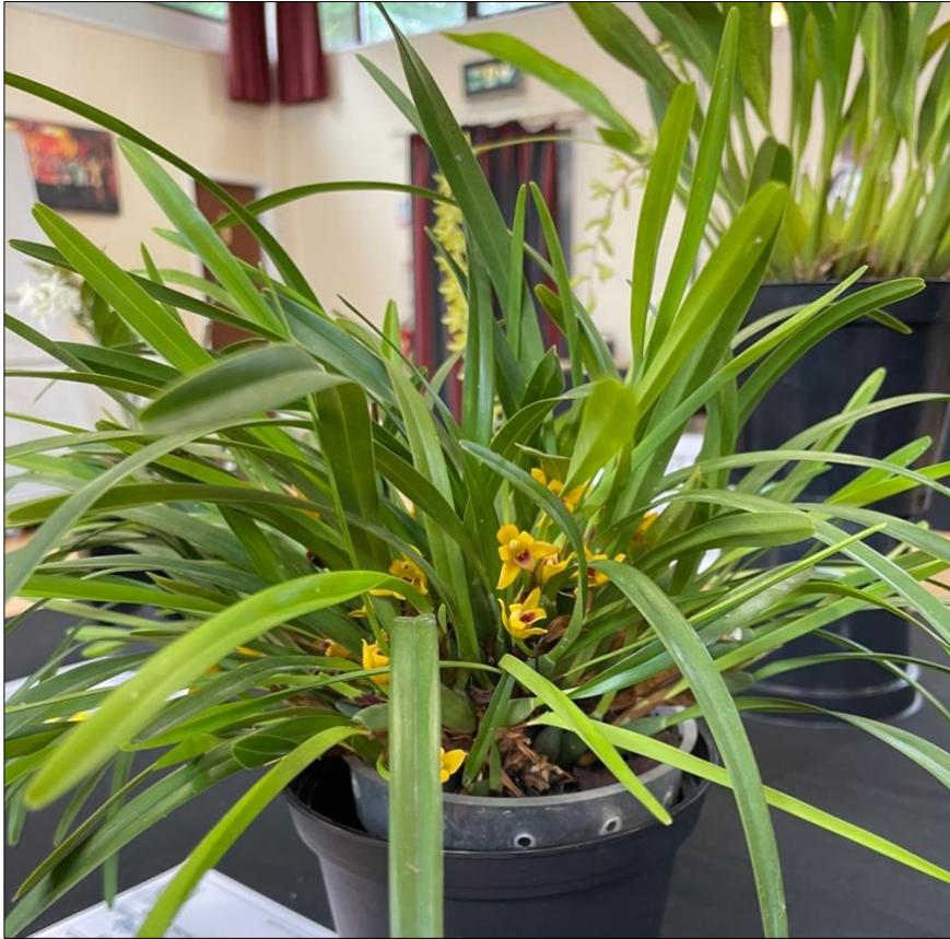
Class 4. Maxillaria variabilis