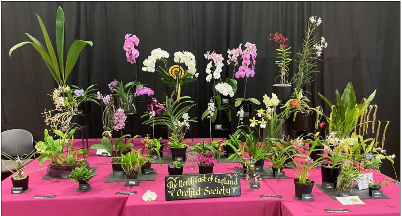
Our hosts: North East of England