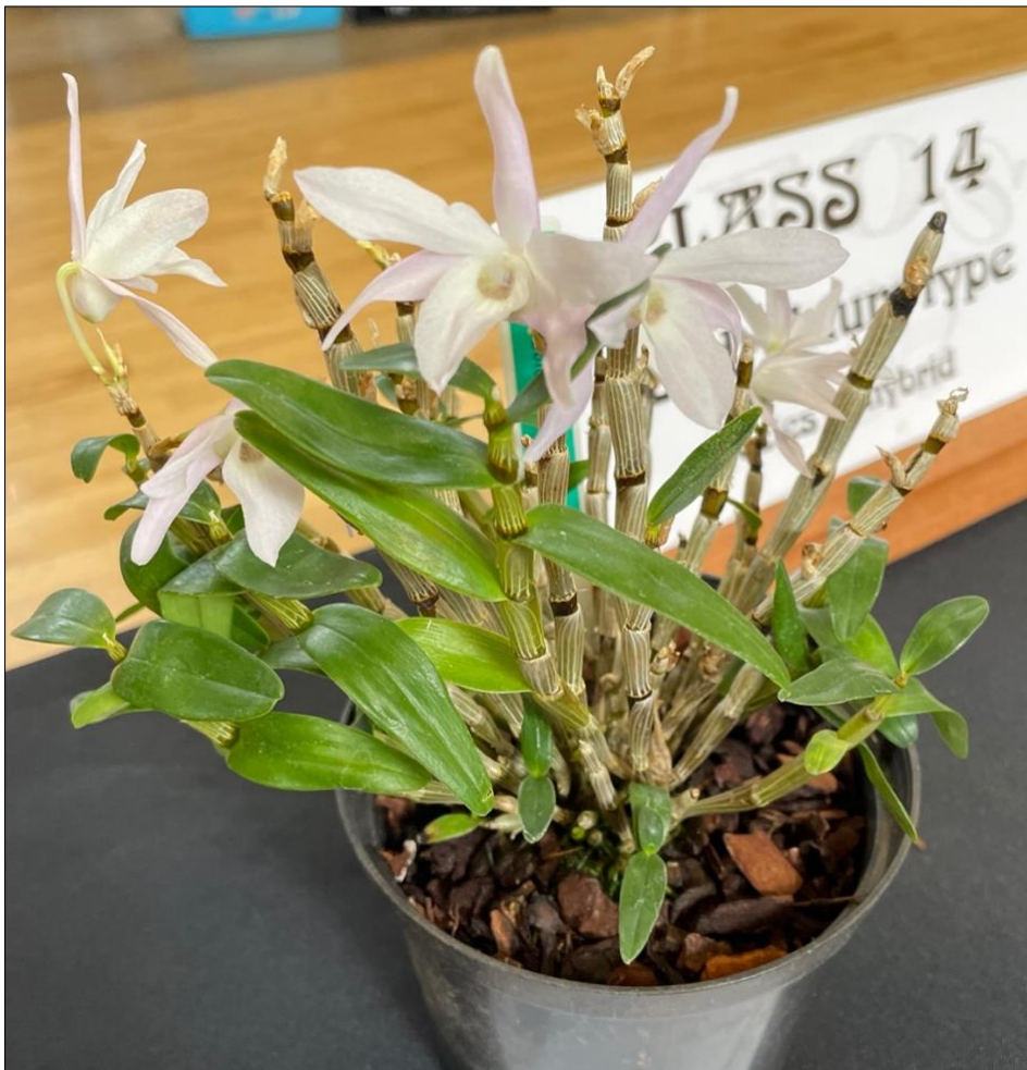
Class 14. Dendrobium moniliforme