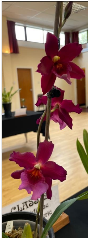
Class 21. Miltonidium Troubled Red