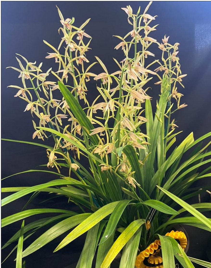
Best Cymbidium Species or Hybrid in Show at the Durham Orchid Show: Barry's Cymbidium munronianum with 10 spikes.