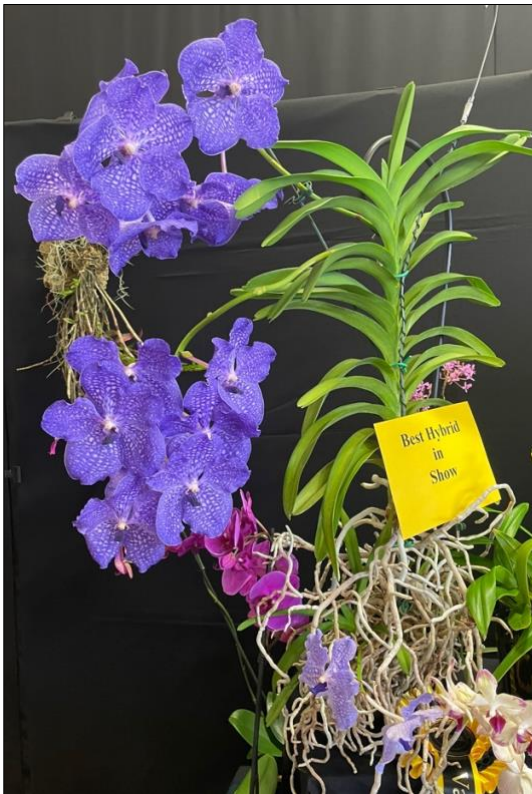
Best Hybrid in Show: Vanda Sansai (Scottish)