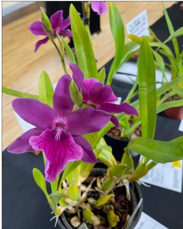
Class 17. Miltonia Queen Anne