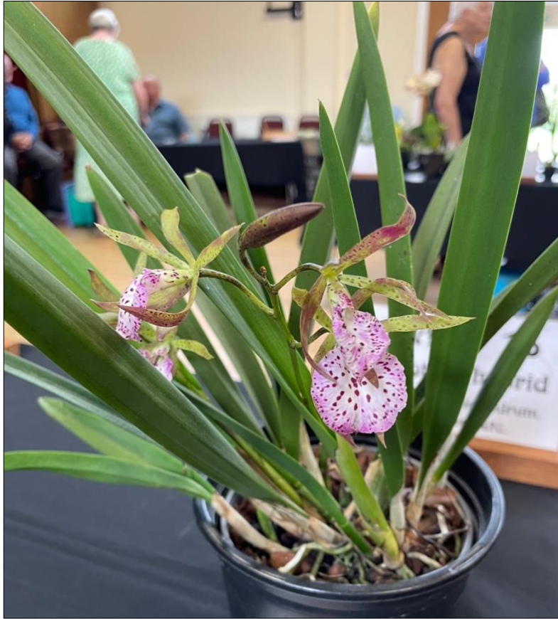
Class 15. Encyvola Jairak Treasure 'Kakapo Bird'