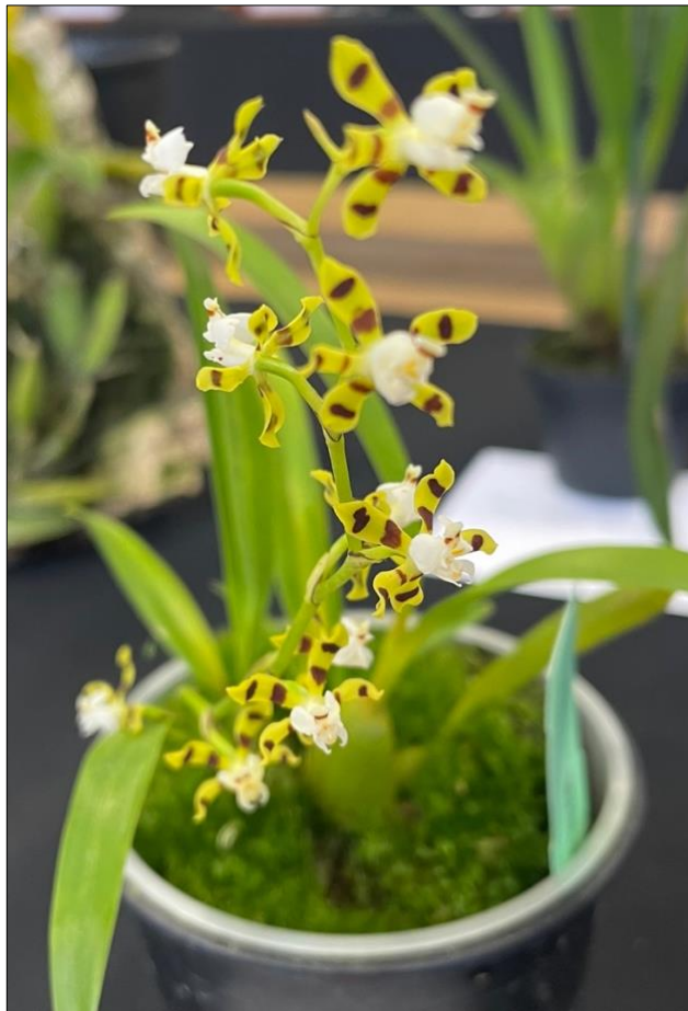
Class 12. Odontoglossum tigroides