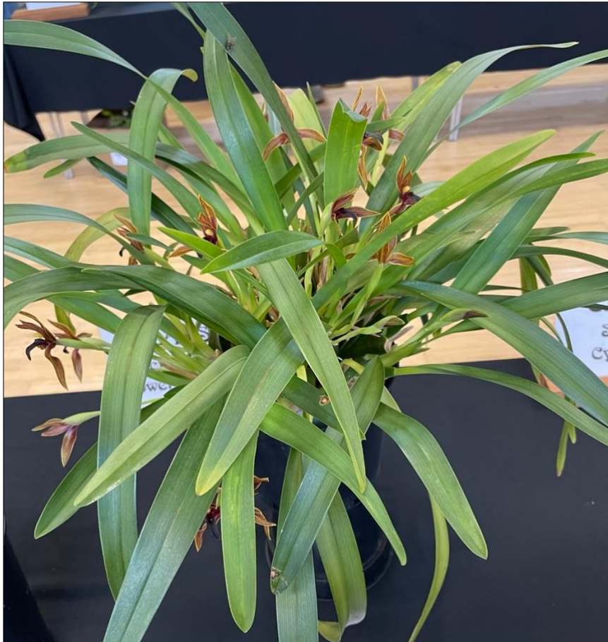
Class 5. Maxillaria hematoglossa