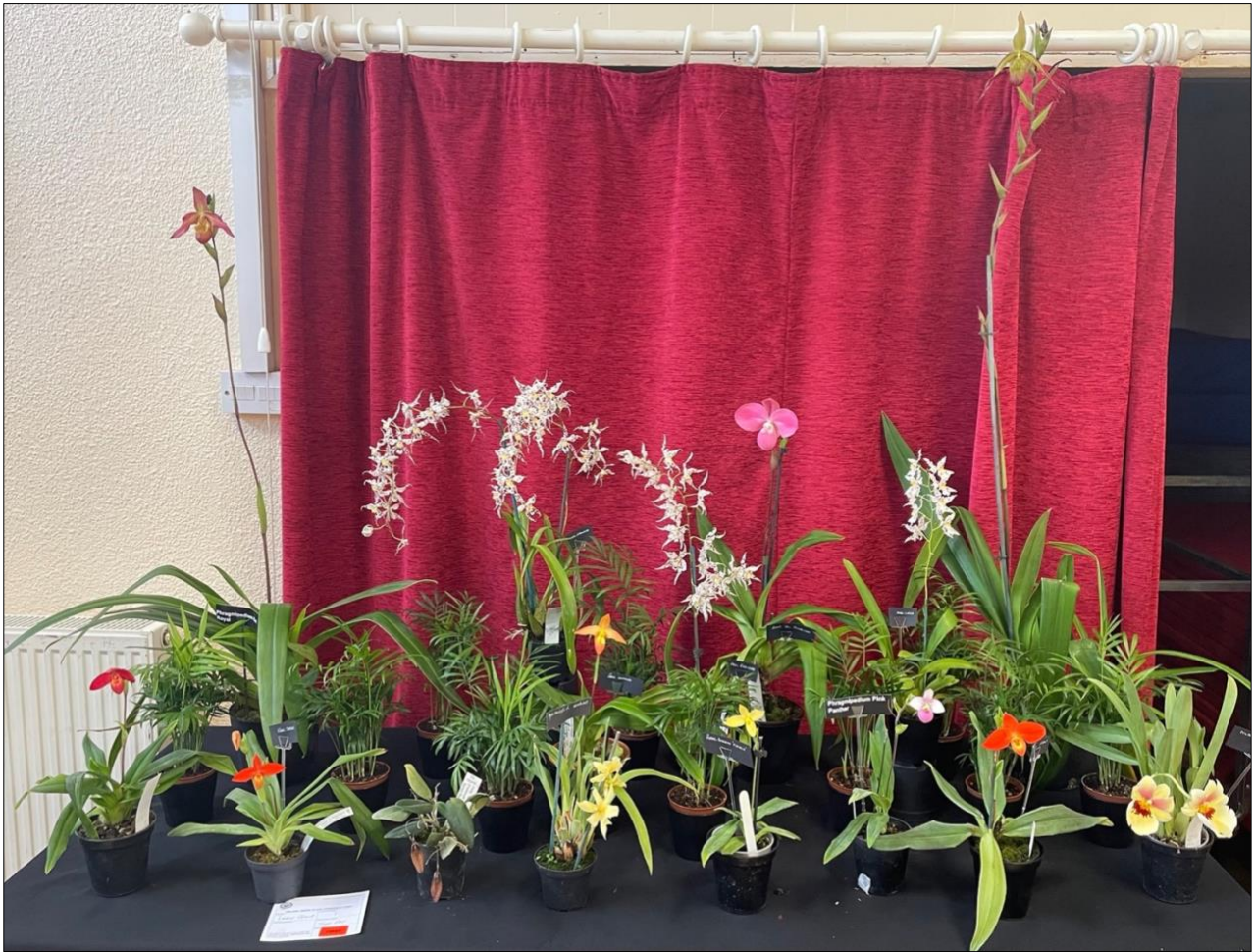
Class 1. Large Group, containing some lovely new Onc. (Odm.) naevium hybrids, and Phragmipediums of greatly differing heights!