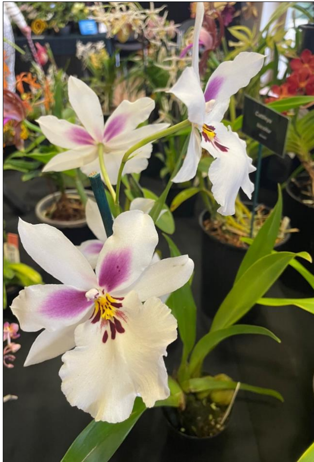
Highly Commended: Phil's Oncidopsis Anquetil