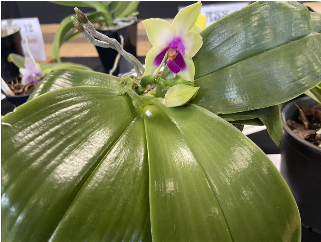
Class 13. Phalaenopsis bellina