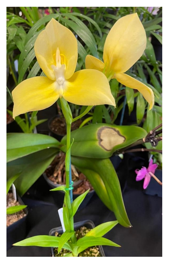
Disa uniflora 'Yellow' ('Rare as hens' teeth', says Mick)