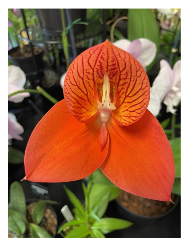
Disa Glasgow Orchid Conference 'Firefly'