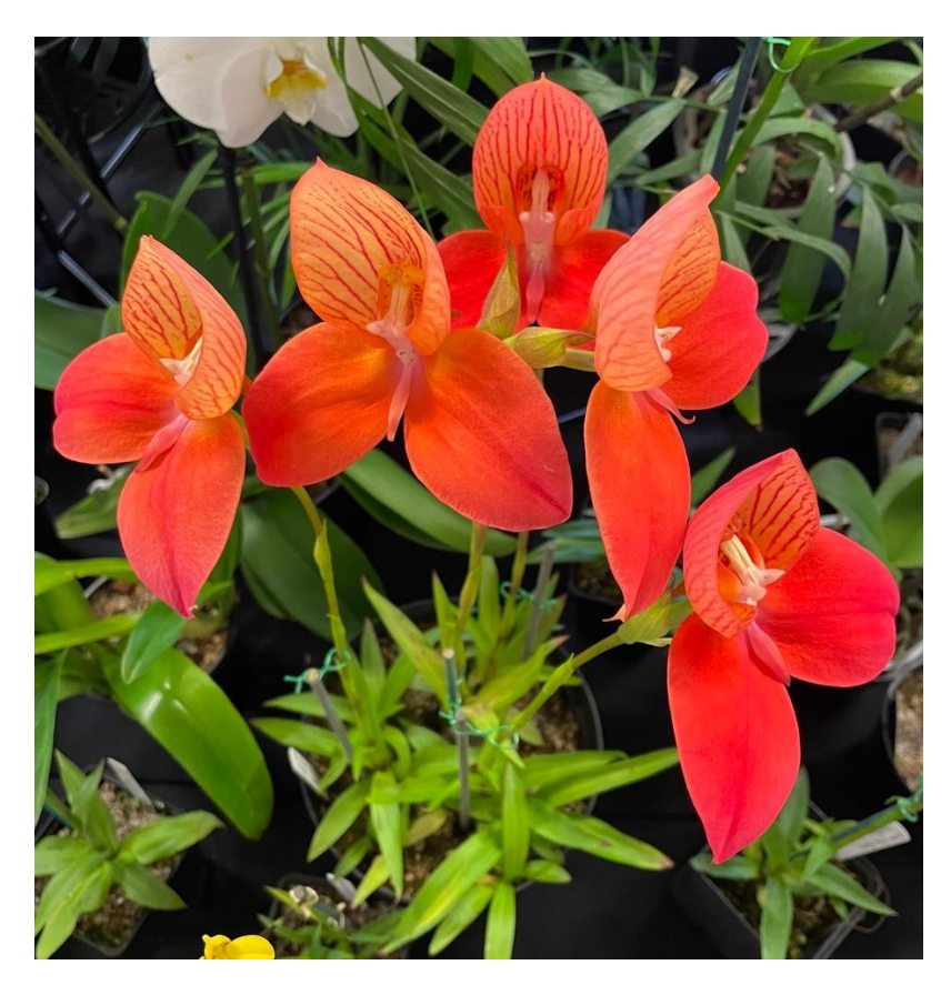
Best Any Other Hybrid - Disa Oak Valley x Ella Avery