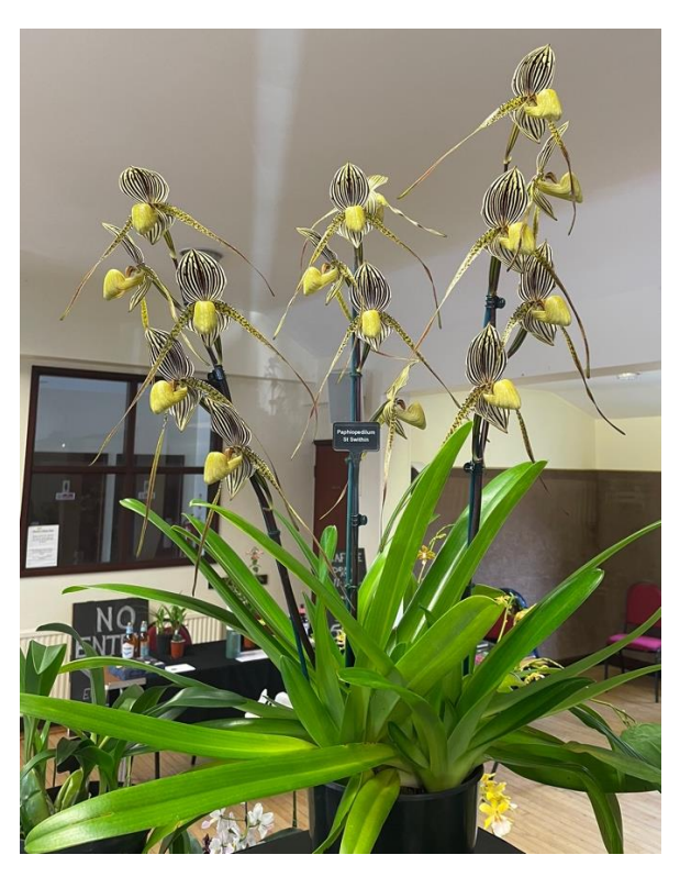
Arthur Deakin's (East Midlands) Paphiopedilum St Swithin which received an RHS Cultural Commendation at the recent Malvern Show