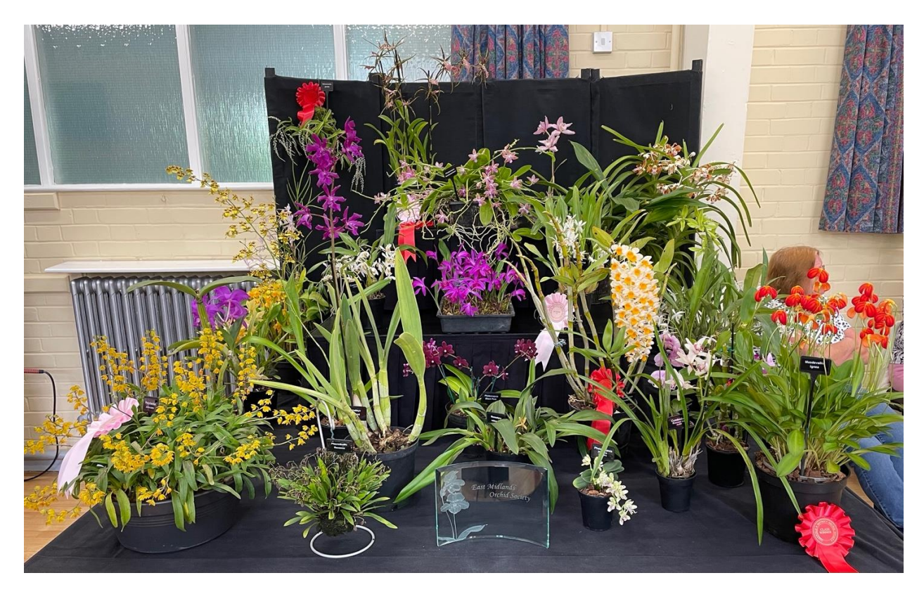
East Midlands OS