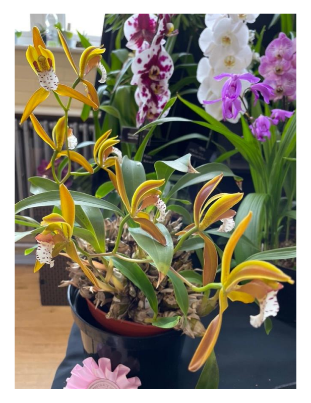
Ian Dorman's Cymbidium tigrinum, a difficult to grow and rarely seen species