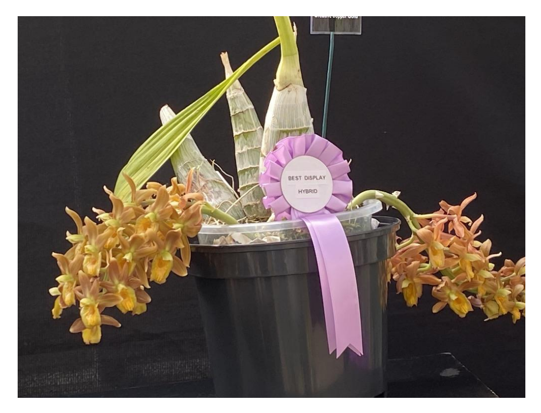
David Crook's Clowesetum Creative Copper Gold – Best NEOS Display Hybrid