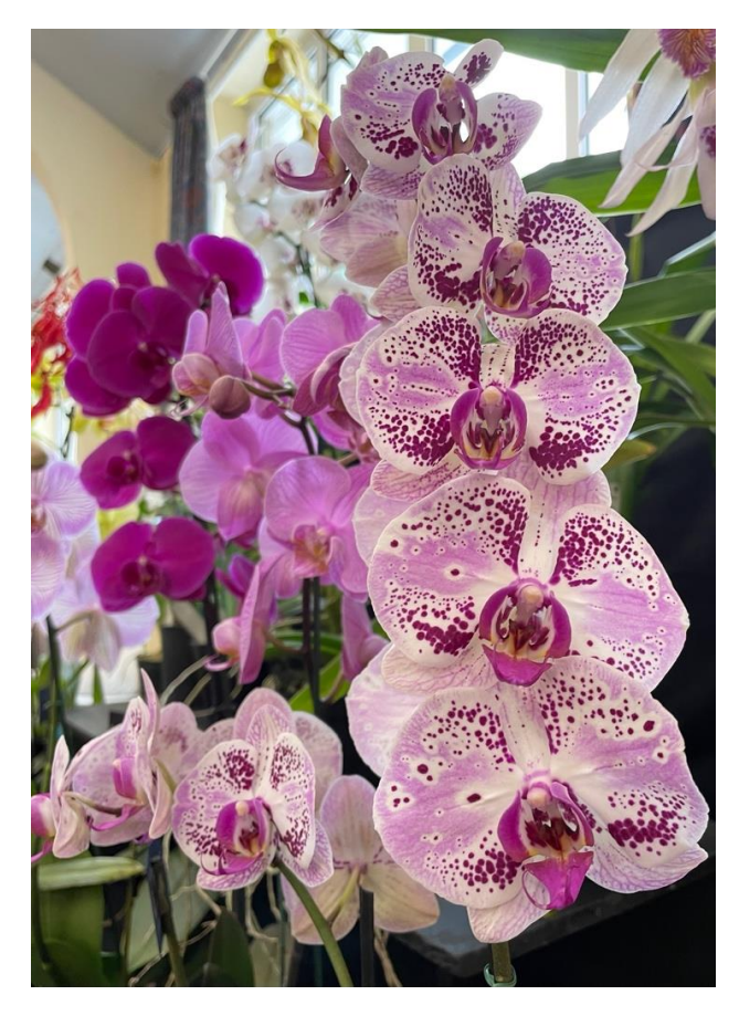
Phal. Taida Pearl 'Fire'