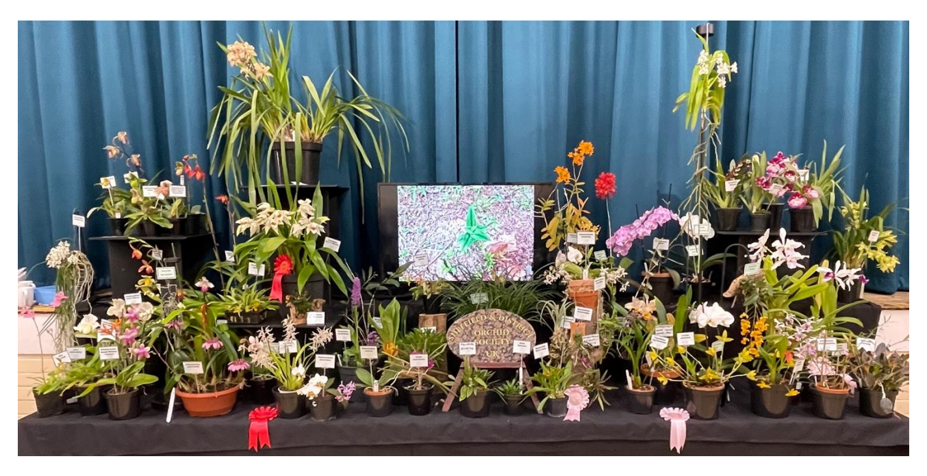
Our hosts: Sheffield and District OS