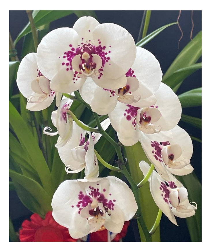
Phal. Ever Spring Fairy