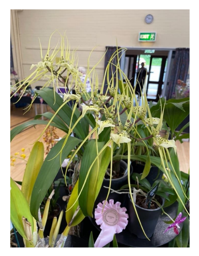
Phil Howard's Brassia verrucose var. majus