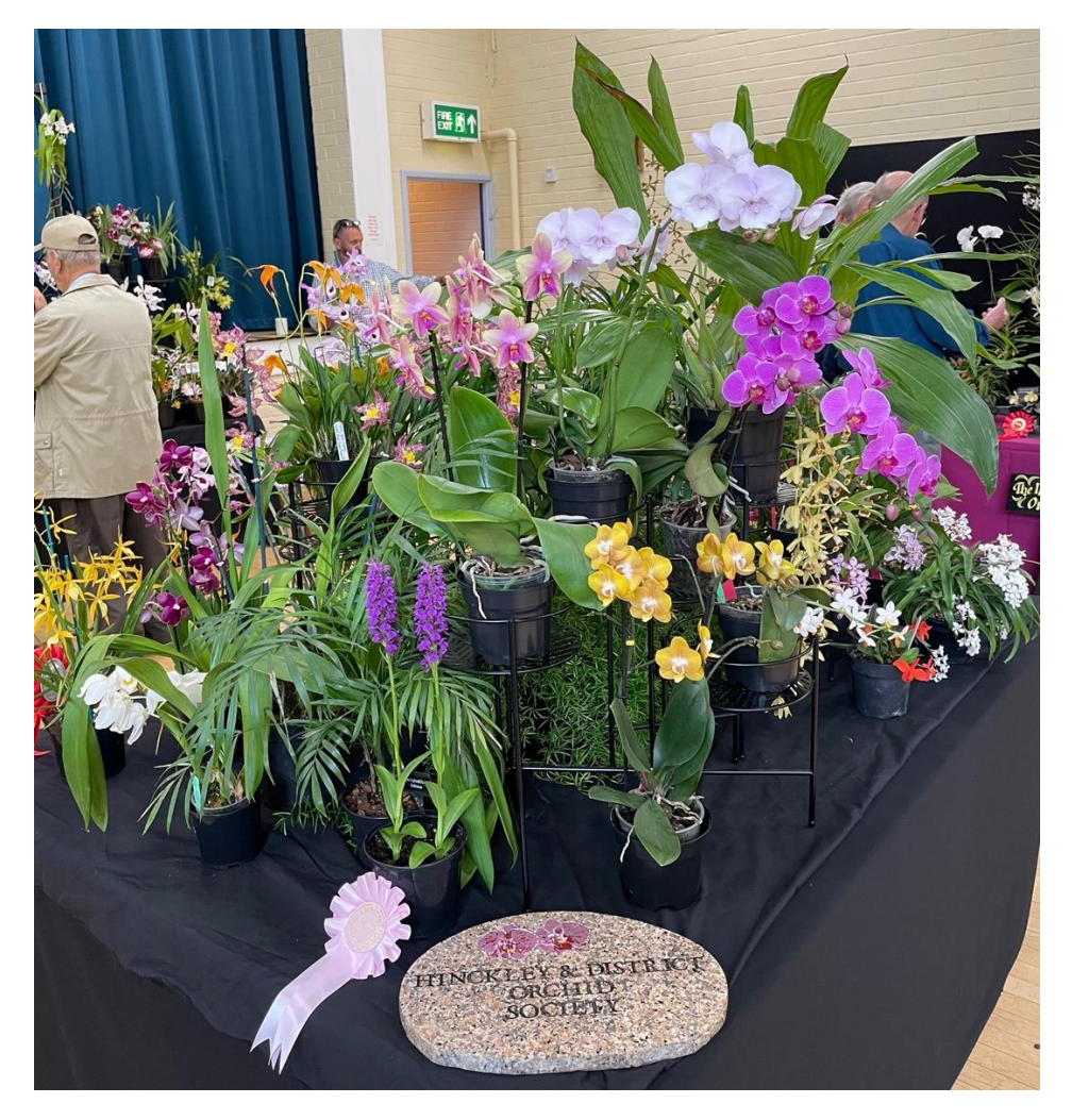
Hinckley and District OS