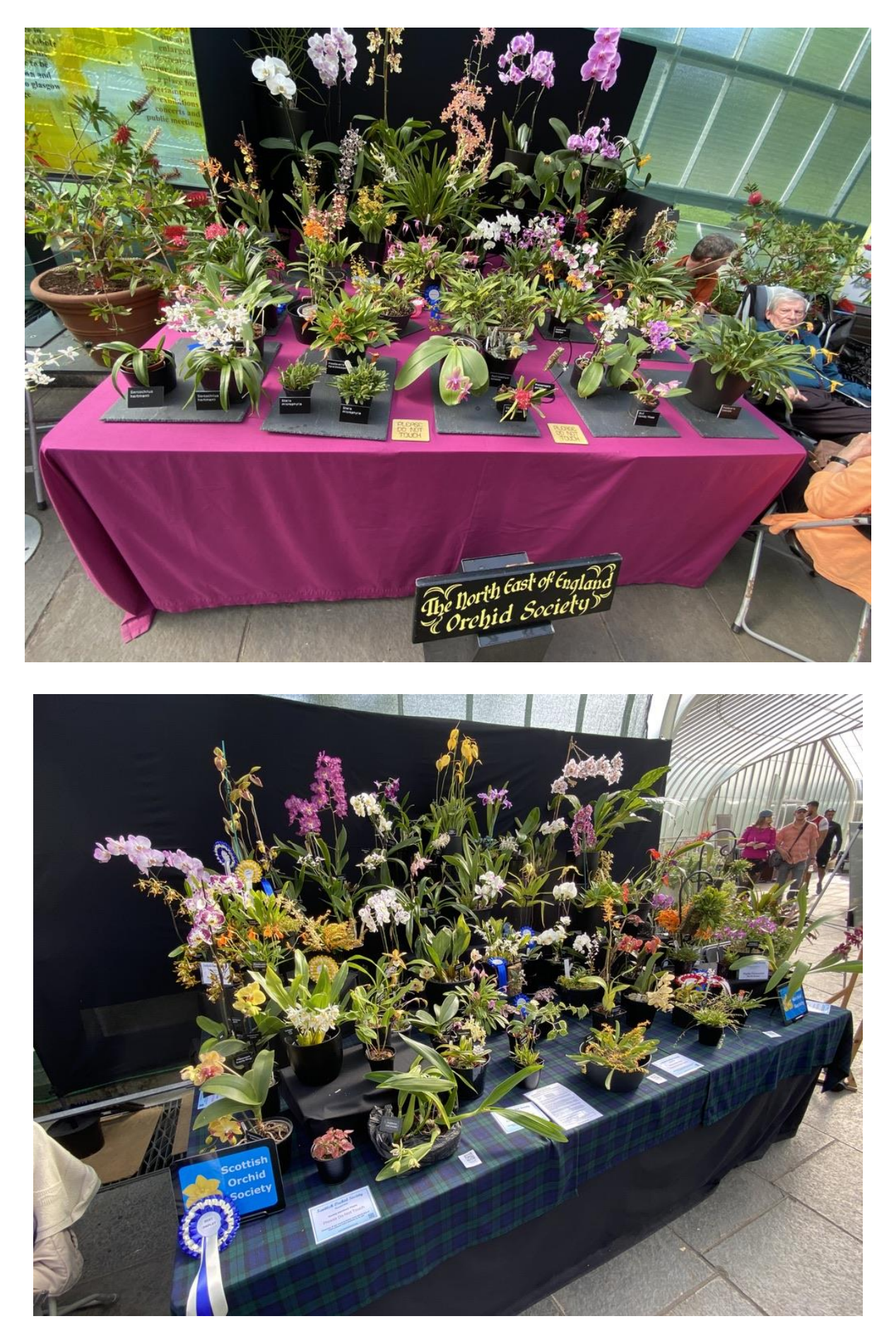
The award for Best Display went to the Scottish OS.