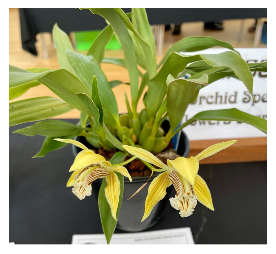
and Masdevallia coccinea Grandiflora