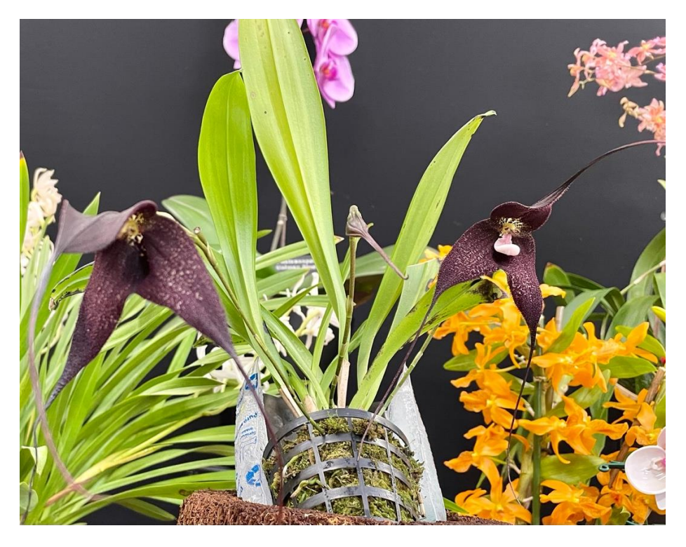
Dracula roezlii, kept cool with an ice pack either side