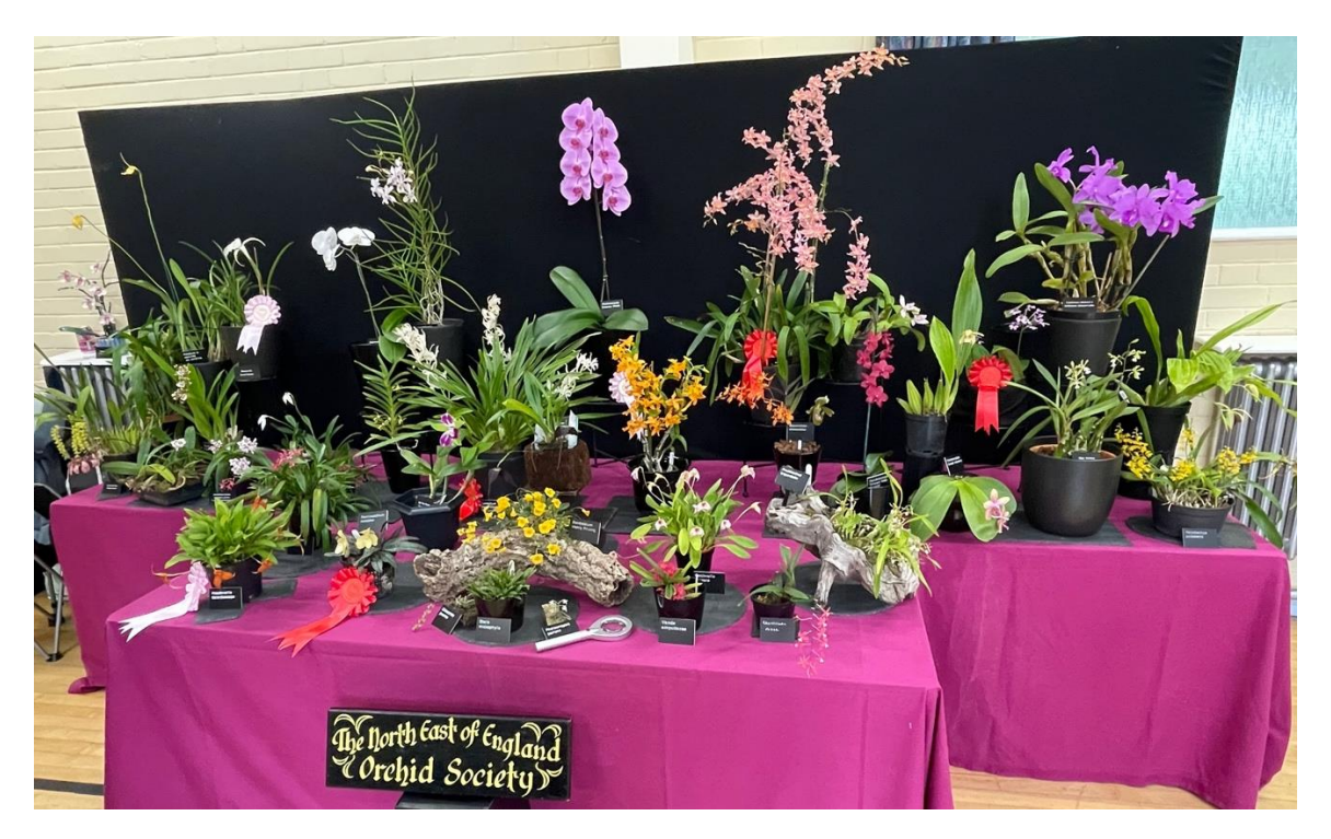
North East of England OS