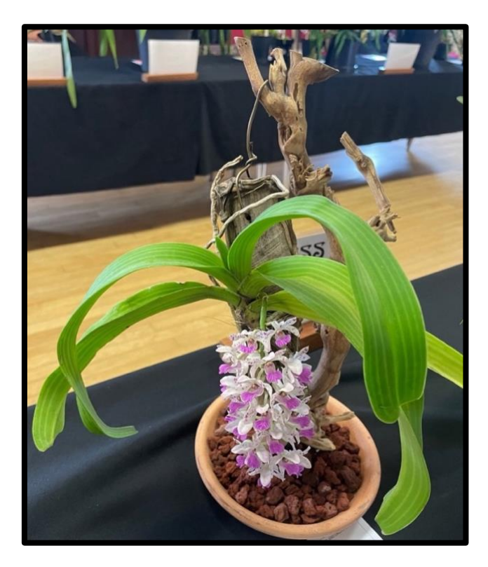
lan Eastwood's Rhynchostylis gigantea