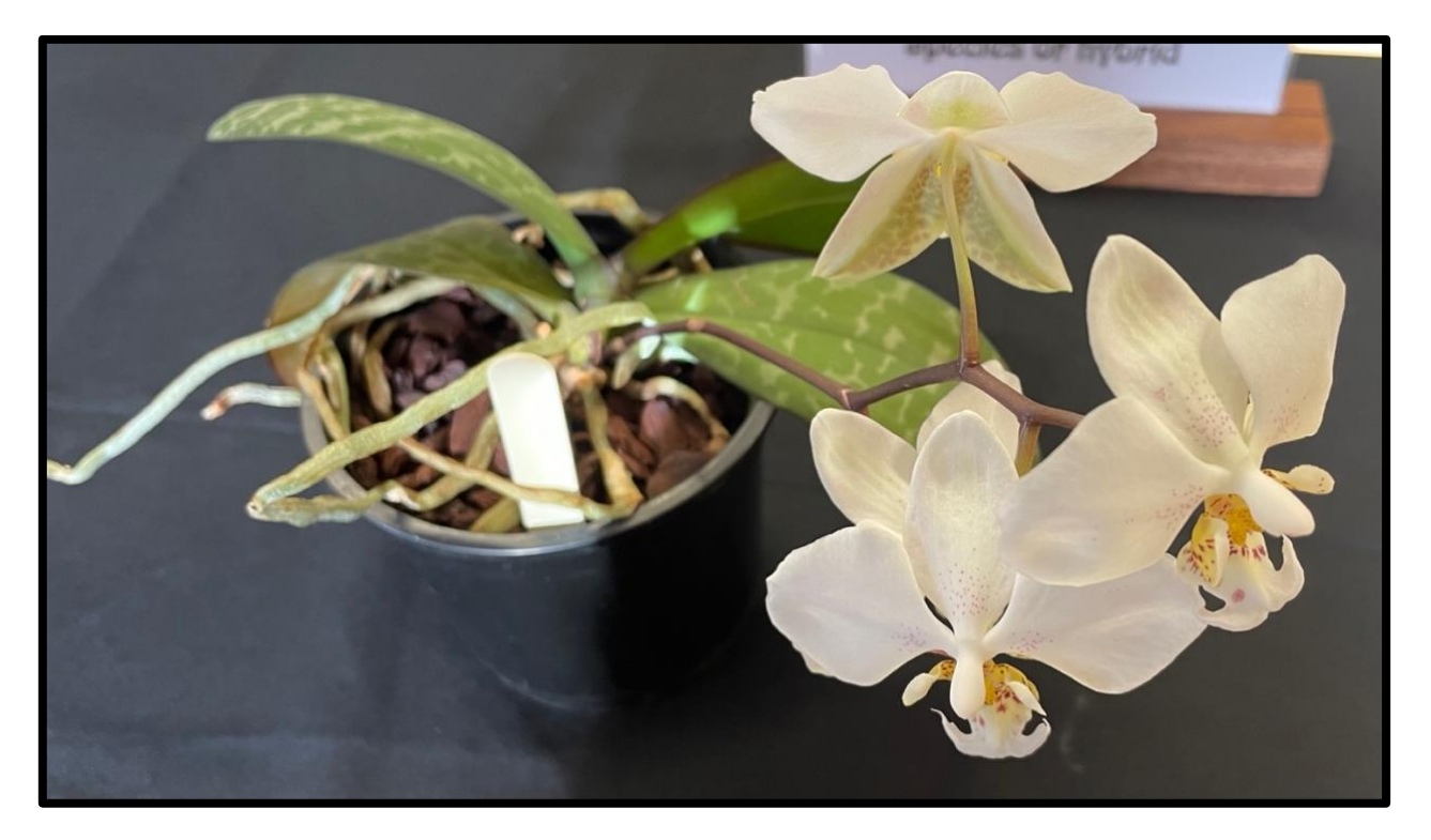
Class 13. Phalaenopsis stuartiana