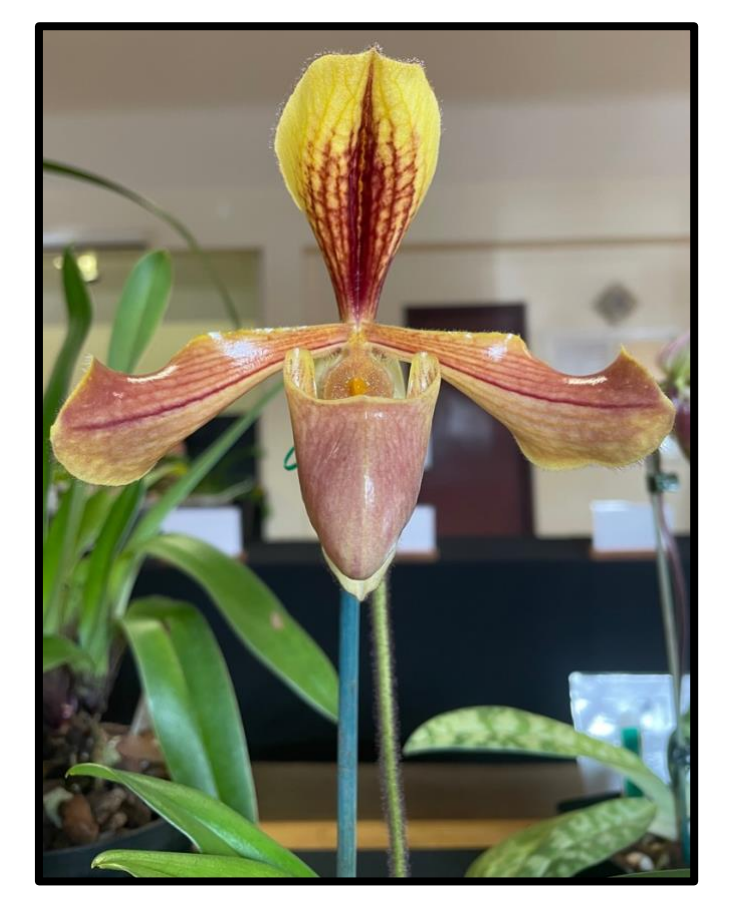
Class 8. Paphiopedilum villosum