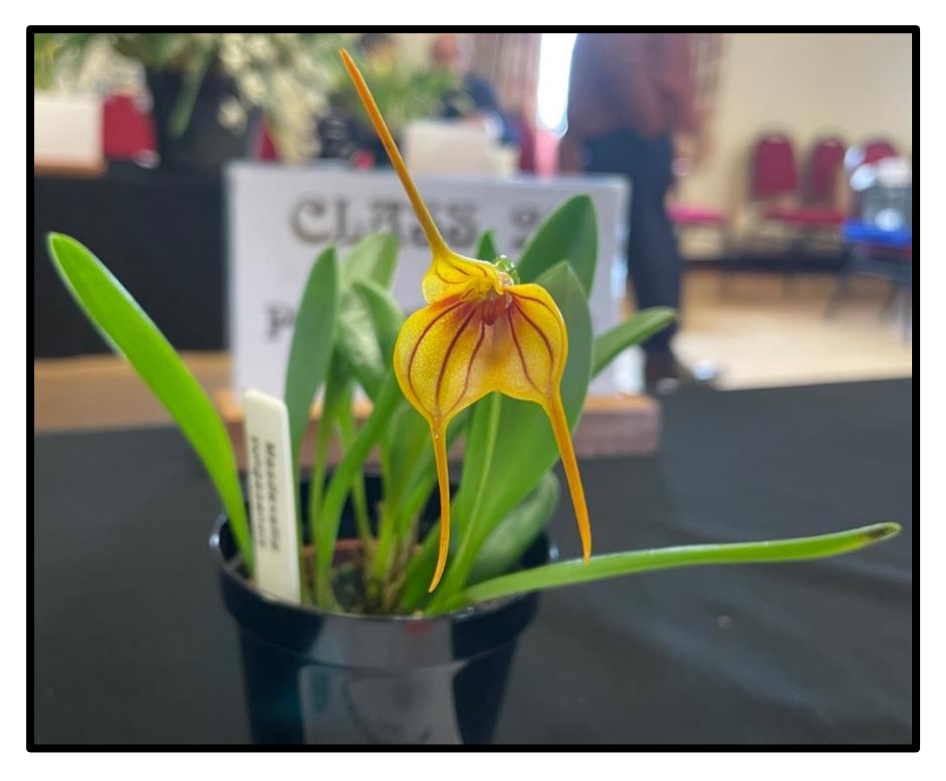
Class 22. Masdevallia yungasensis