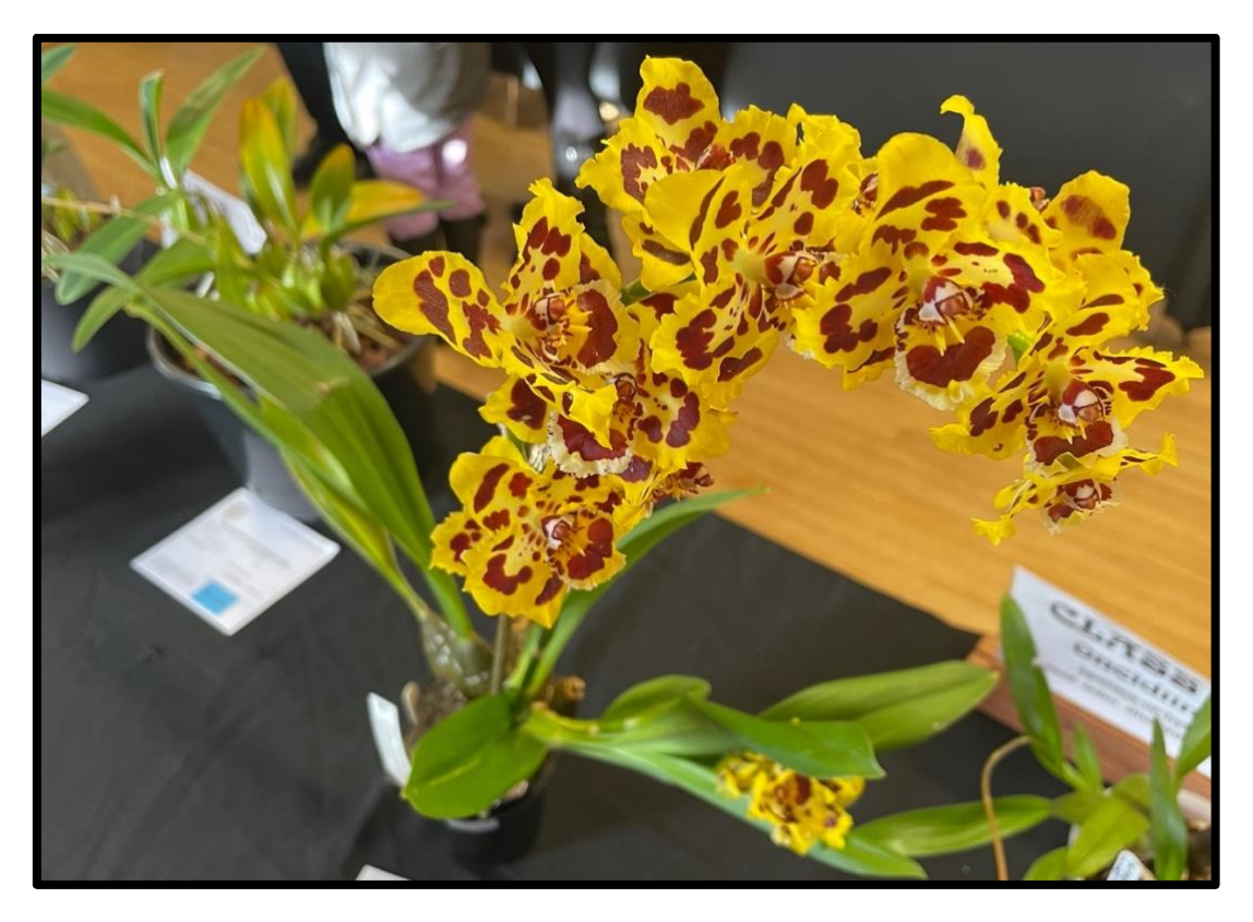
Class 11. Oncidium Col de la Rocque