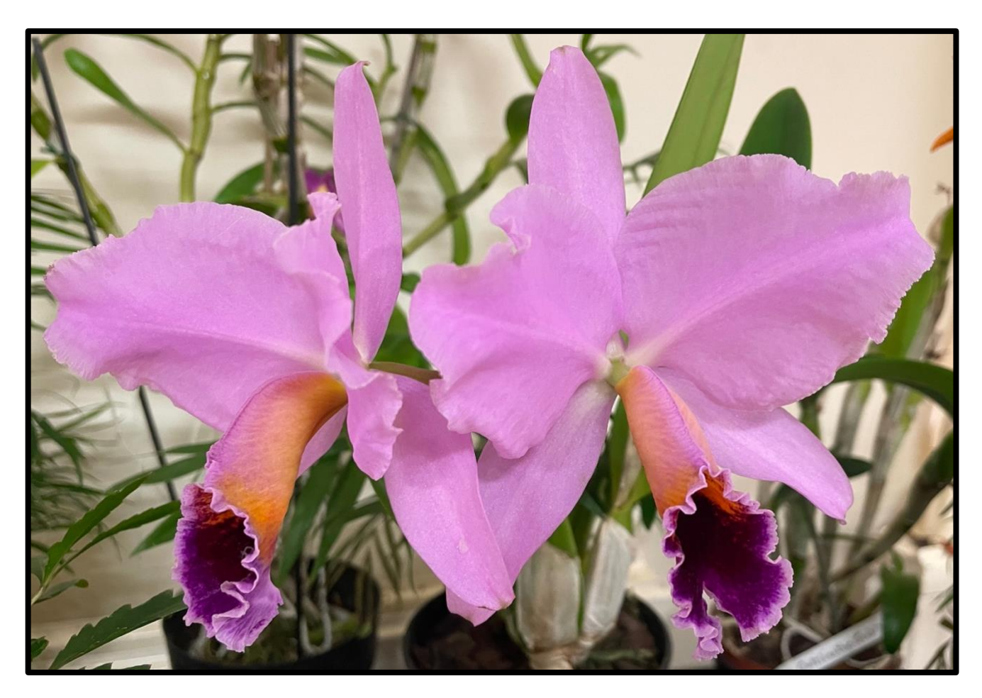
In close-up: Cattleya percivaliana 'Summit' FCC/AOS