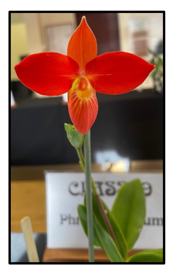
Class 9. Phragmipedium besseae