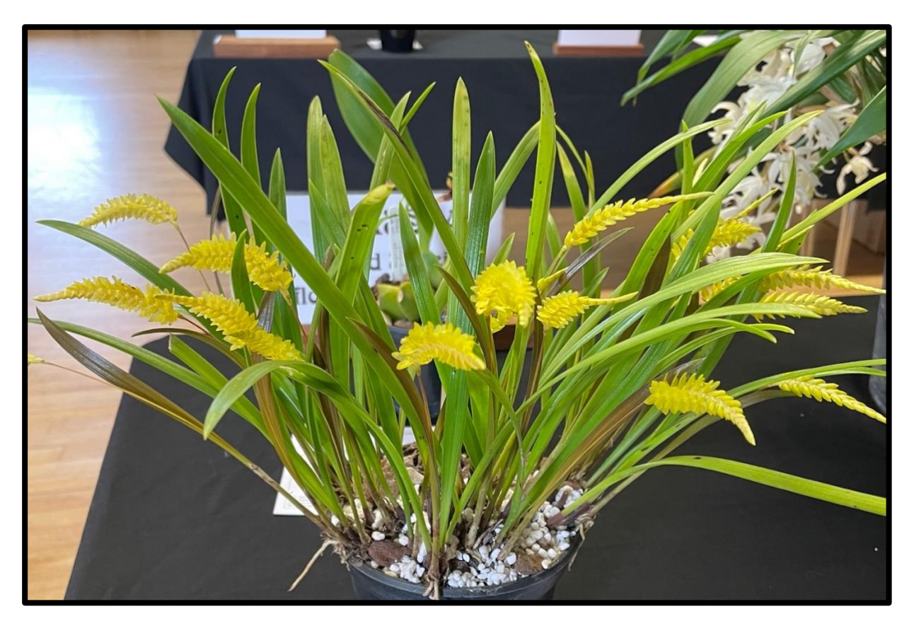
Class 4. Dendrochilum javierense