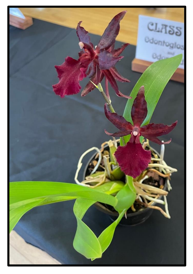
Class 12. Colmanara Wildcat