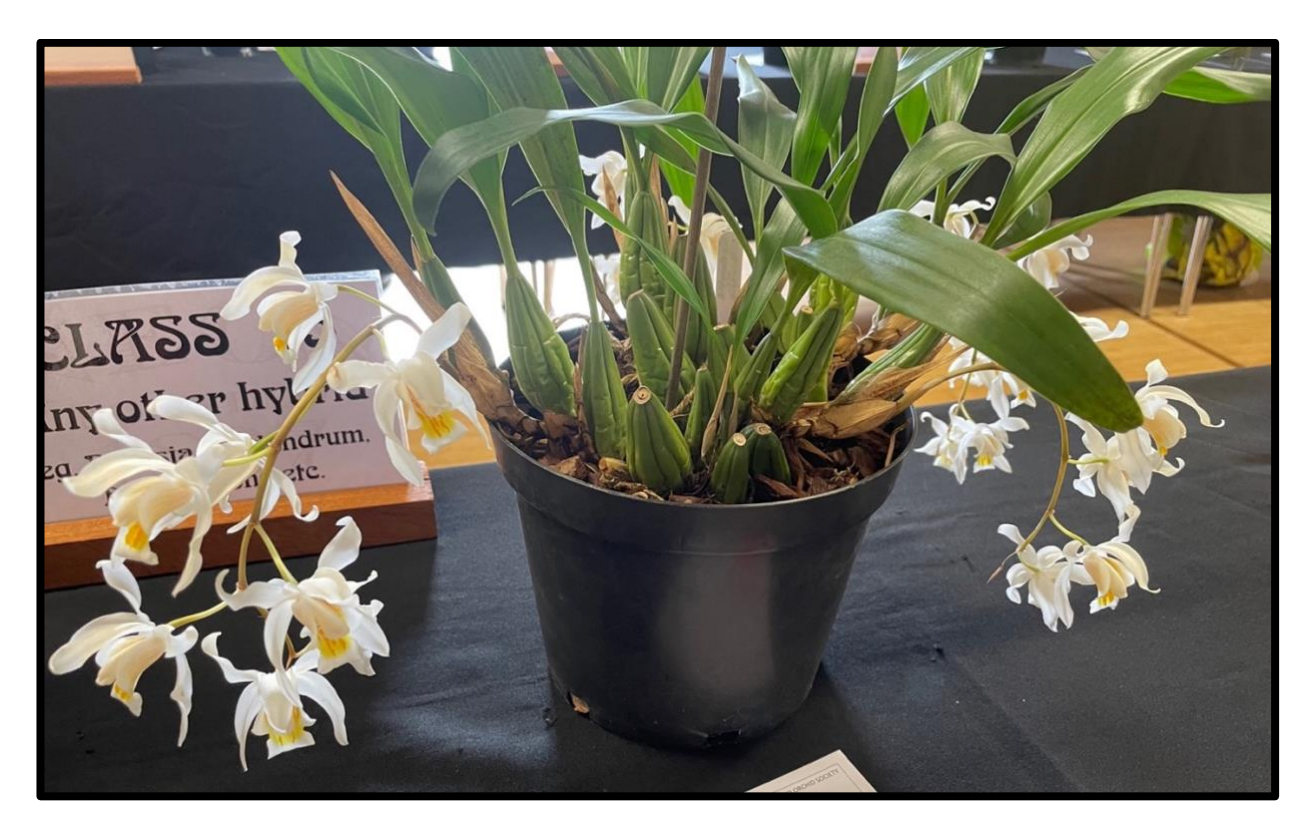
Class 15. Coelogyne intermedia