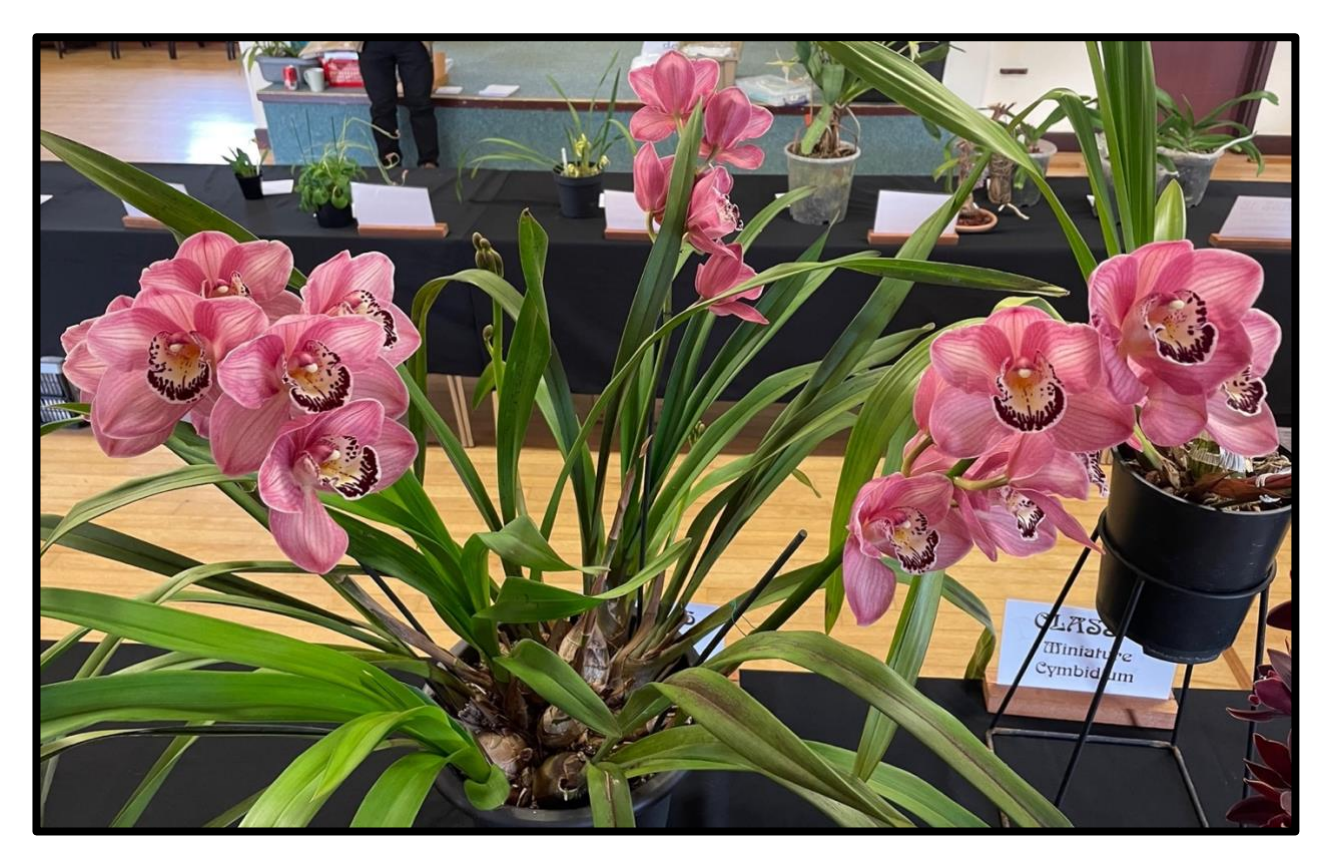
Class 6. Cymbidium Shirley