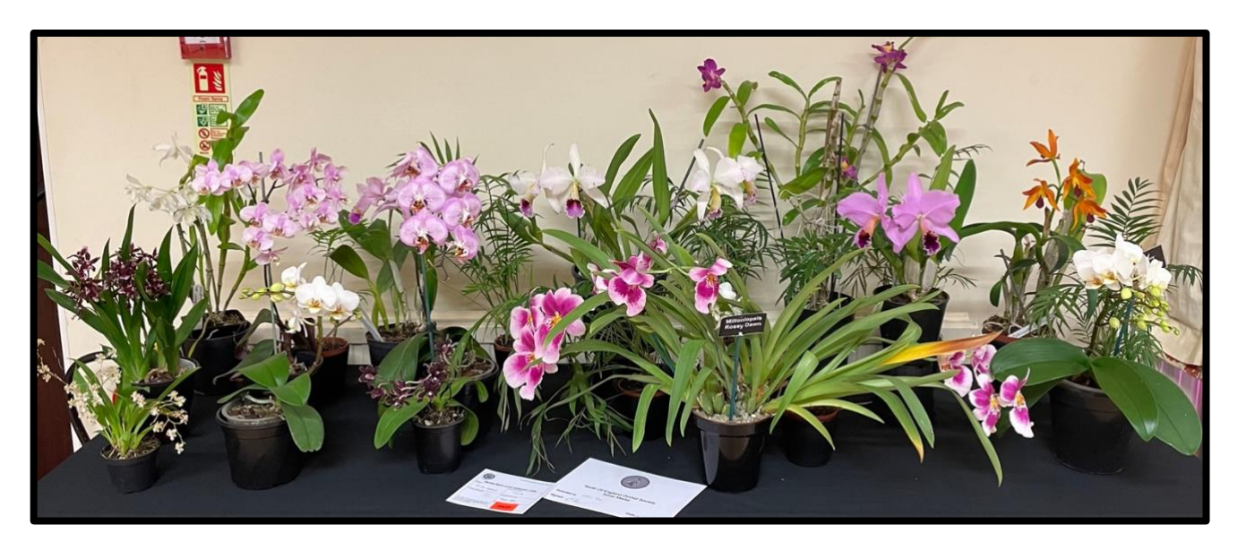
Class 2. Small group