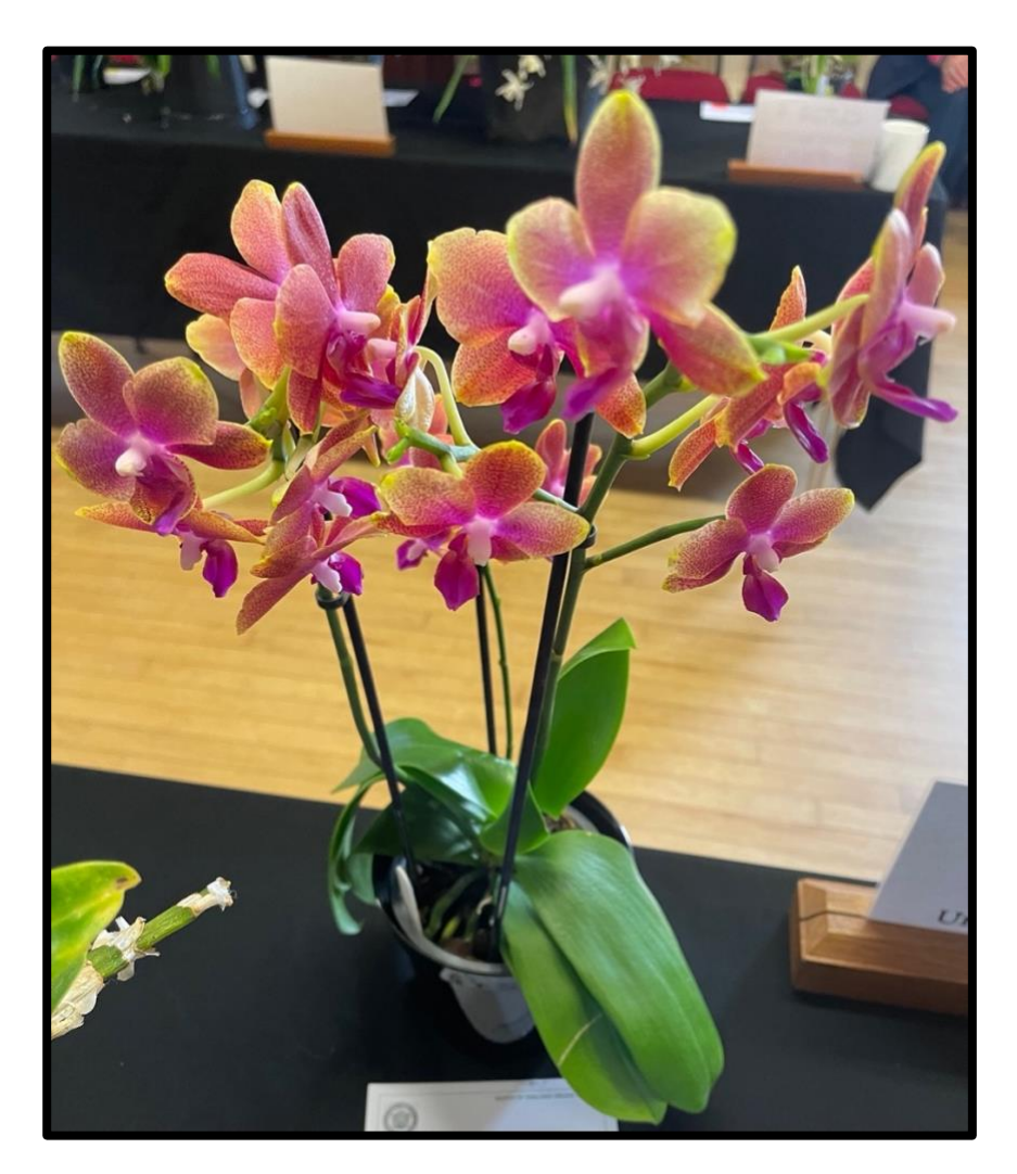
Class 23. Phalaenopsis hybrid