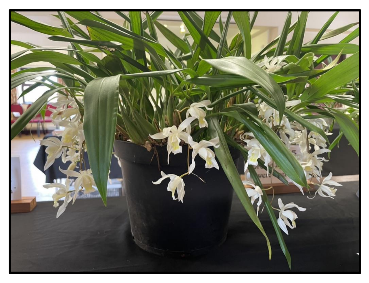
Class 5. Coelogyne glandulosa