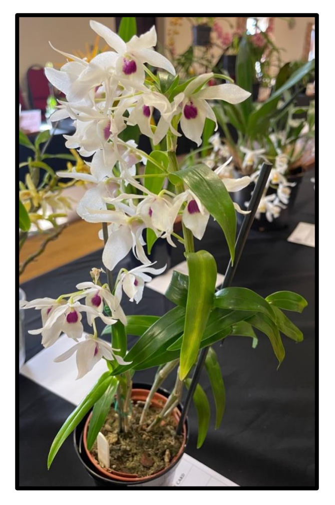
Class 14. Dendrobium Cassiope