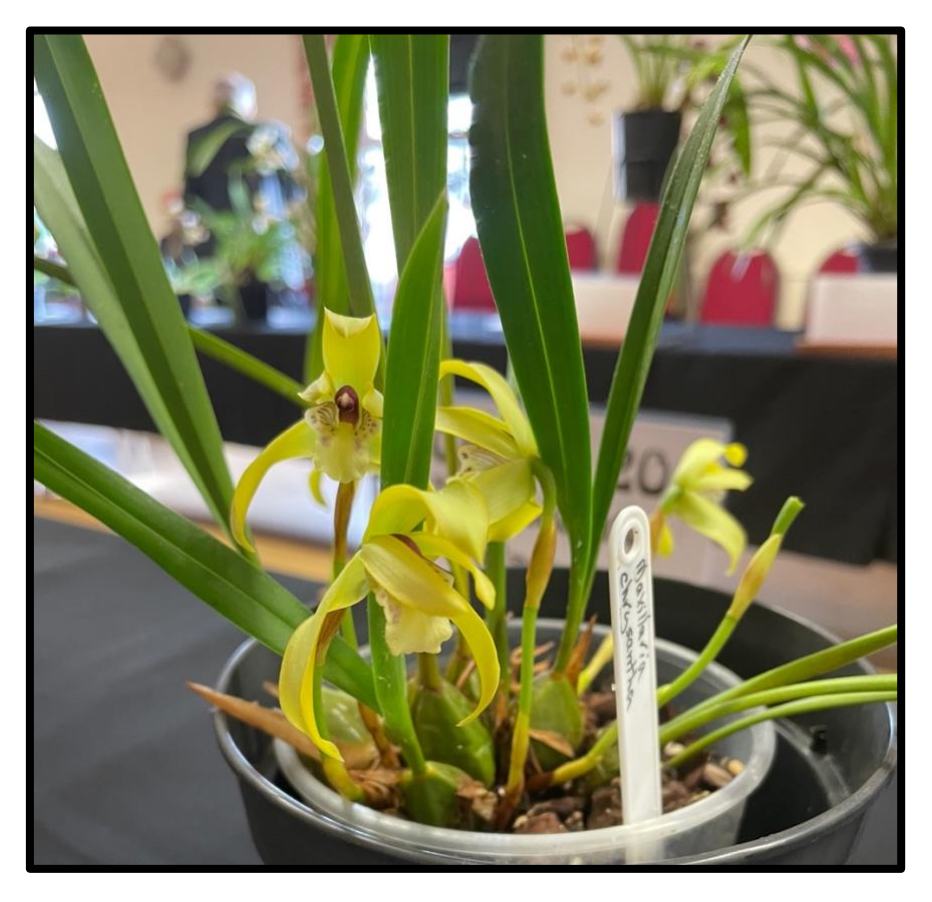
Class 20. Maxillaria chrysantha