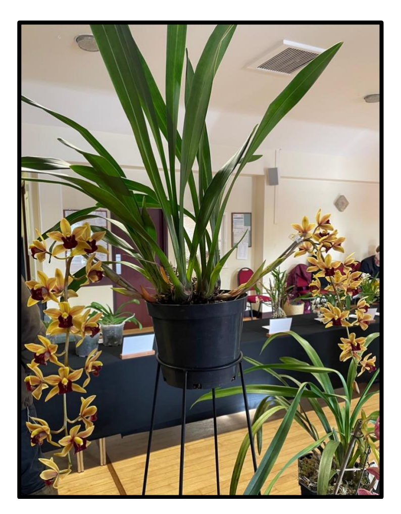
Class 7. Cymbidium Marvin Gaye 'Royale'