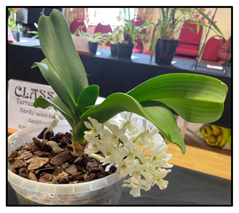
Class 19. Rhynchostylis gigantea White.