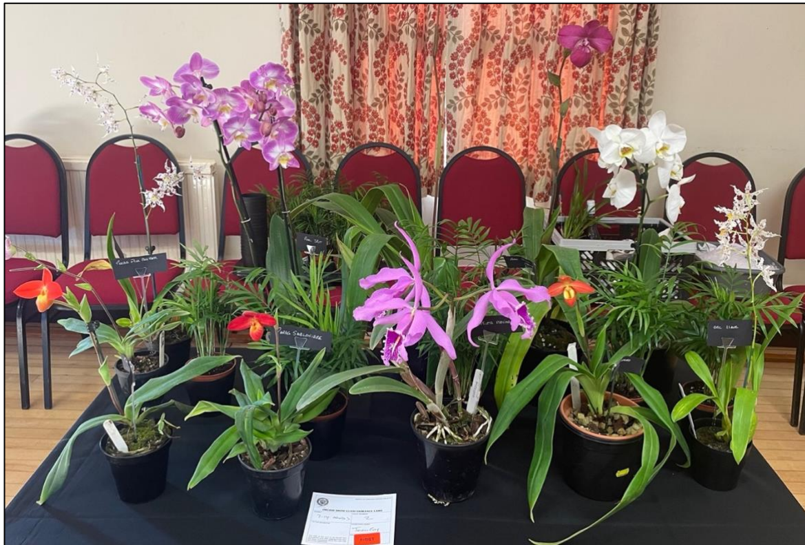
Class 1. Large Group