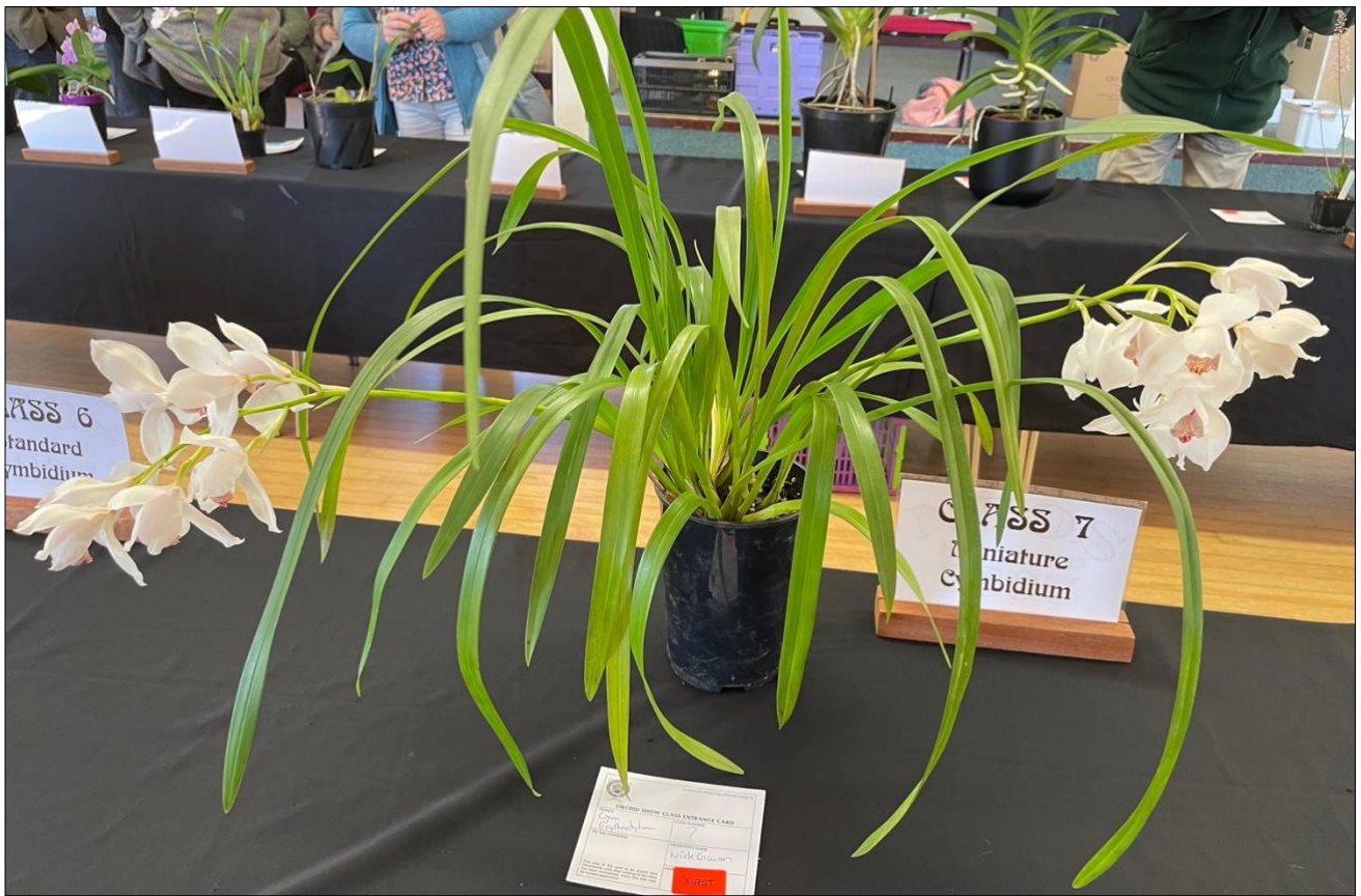
Class 7. Cymbidium erythrostylum