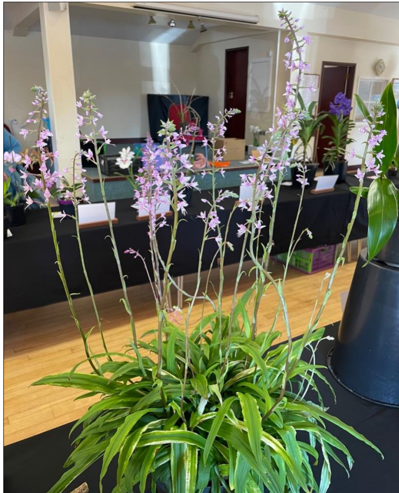
Sheila's Class 4 Stenoglottis longifolia