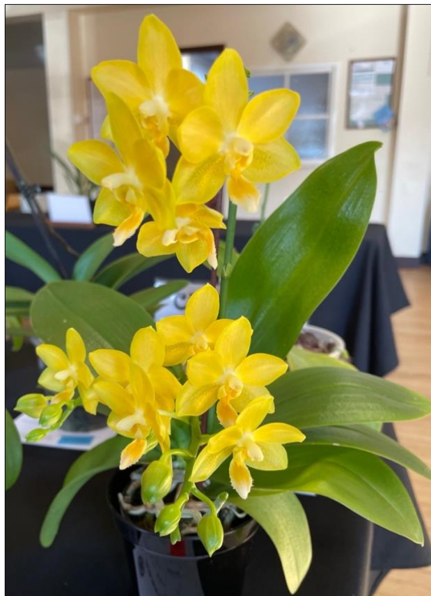
Class 13. Phalaenopsis Yaphon Perfume 'Yellow'