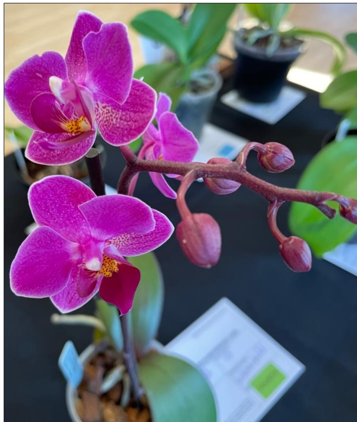
Liz's Class 13 Doritaenopsis An Tai Pixie