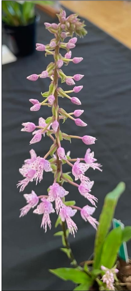
Class 18. Stenoglottis longifolia