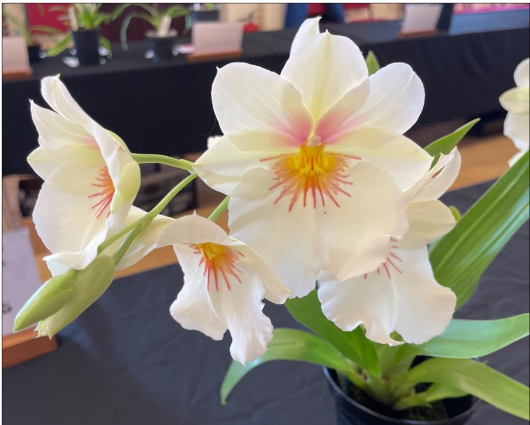
Class 17. Miltoniopsis Malitoine