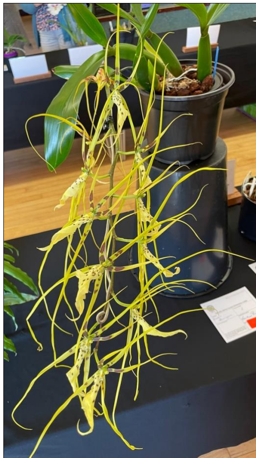
Class 5. Brassia arcuigera