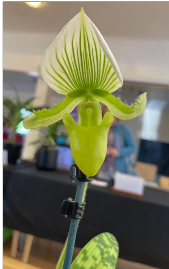
Class 8. Paphiopedilum Maudiae 'Femina'