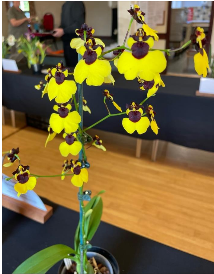
Class 11. ( Oncidium varicosum x Gomesa Moon Shadow ) 'Little Panda'