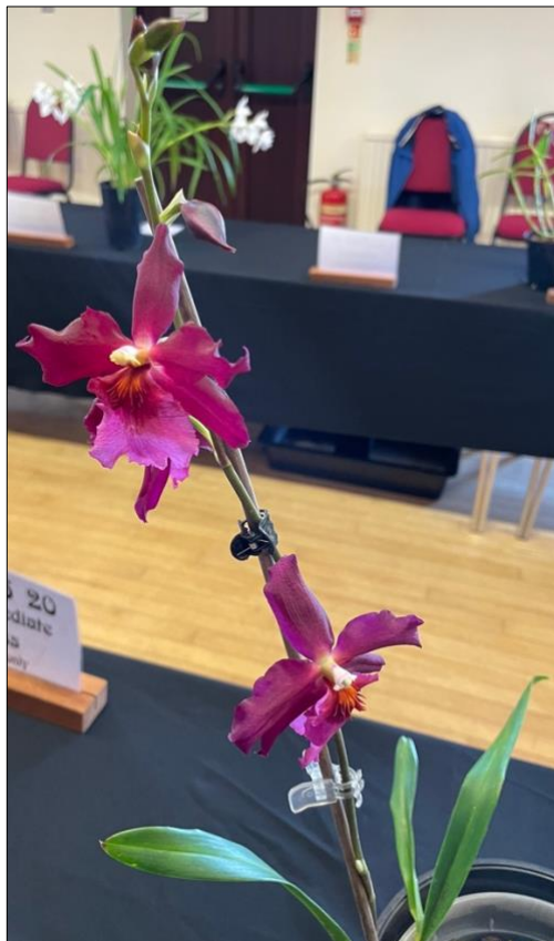
Class 21. Miltonidium Troubled Red