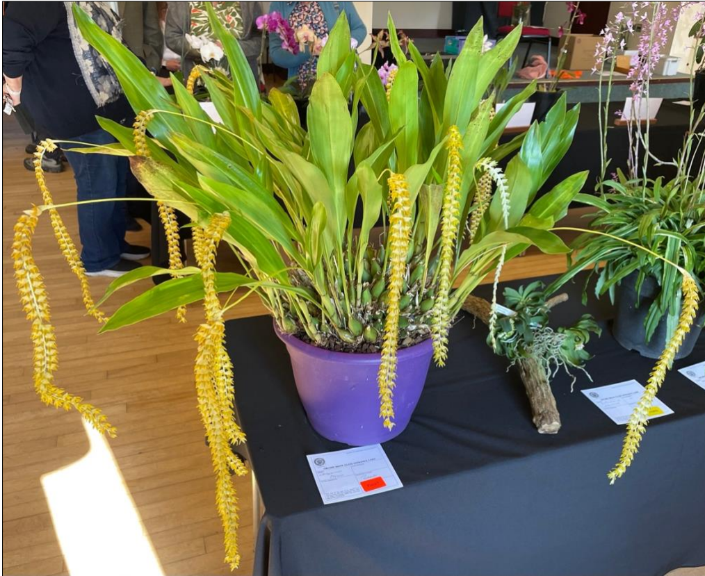
Class 4. Dendrochilum magnum