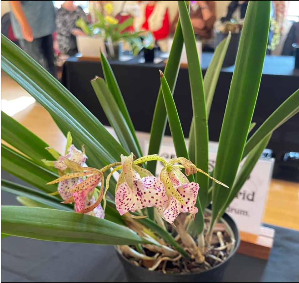
Class 15. Encyovola Jairak Treasure 'Kakapo Bird'