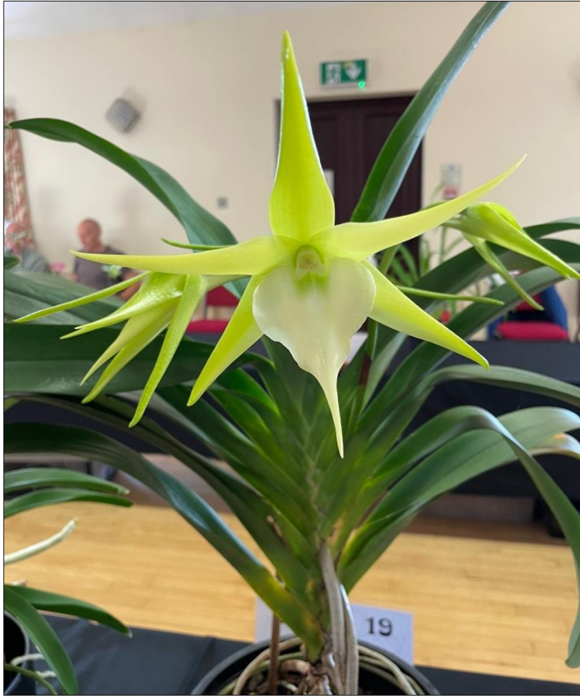
Eddie's Class 19 Angraecum Crestwood