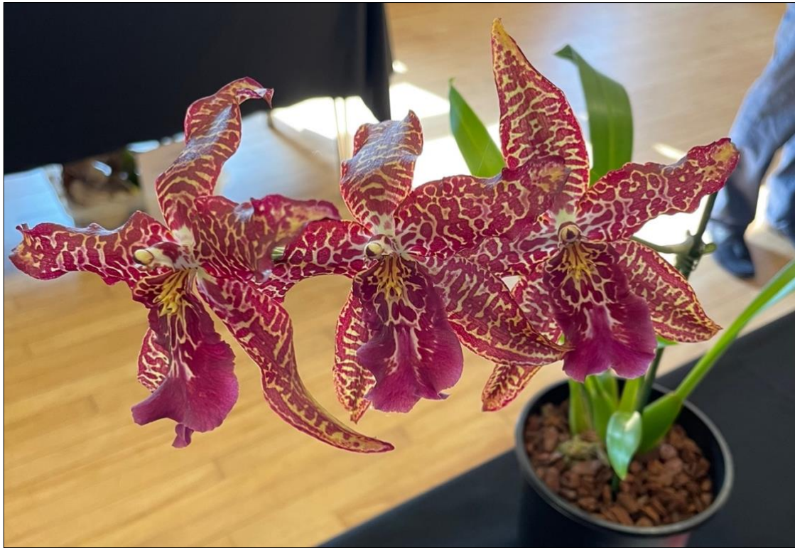
Class 23. Beallara Marfitch